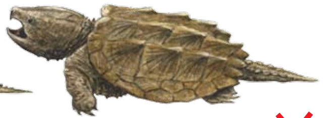
ALLIGATOR SNAPPING TURTLE Illegal to take