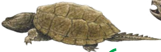
COMMON SNAPPING TURTLE Legal to take