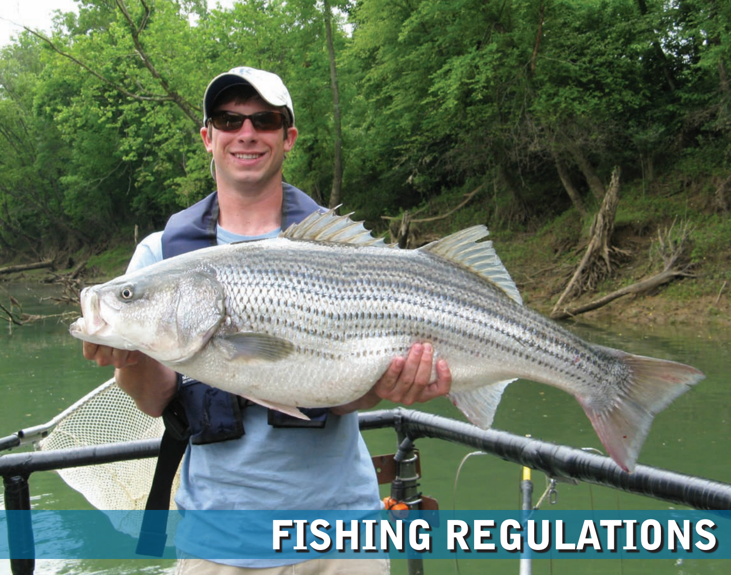
Dave Dreves photo