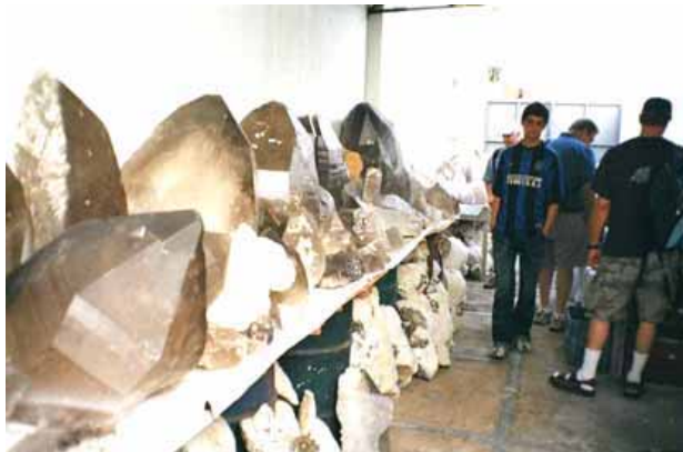
merchants who frequent the Annual Tucson show.