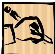
DARLENE'S DOODLES NFMS Bulletin Aids