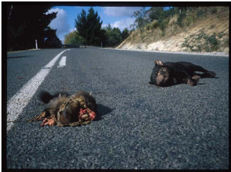
Figure 7: Casualties of the road — Tasmanian devil and food

Much of the core habitat for Tasmanian devils contains roads, and devils have relatively large home ranges and movements. Devils use roads for long-distance travel (Jones 2000). Roads are a source of carcasses, so they attract devils to feed. (Figure 7). Being black, devils are hard to see on dark coloured tarmac, particularly in wet conditions. At night they can get disorientated by headlights and often do not move quickly enough to avoid being hit by fast-moving vehicles. Most collisions are fatal for the devil. Although devils make up a small proportion of the total wildlife killed on Tasmanian roads, it was estimated that during 2001–04 approximately 3392 devils were killed on roads each year (Hobday and Minstrell 2008). A previous estimate for 1998 was 5000 per year (N. Mooney unpublished). However, there are indications that the total number of devils killed on roads is declining with the decline in the population (Jones et al. 2007).