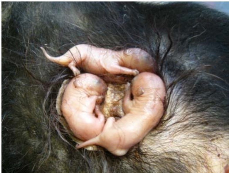
Figure 2: Tasmanian devil pups about 5 weeks old (around 2 cm)

Tasmanian devil vocalisations include snorts, whines, grunts, coughs, hollow barks, growls, shrieks and screams (hence the name 'devil'). These noises are mostly heard when many devils gather around a carcass to feed. Although the noise and displays are mostly bluff to establish dominance, when there are high numbers of devils in an area the biting rates at feeding increases. During feeding encounters juveniles are bitten more frequently, mostly on the limbs, while bites resulting in head injuries are more common in adults during the mating season (Hamede et al. 2008). These injuries occur when males fight, females defend themselves to avoid mating with smaller males, and males bite females on the neck during mating.