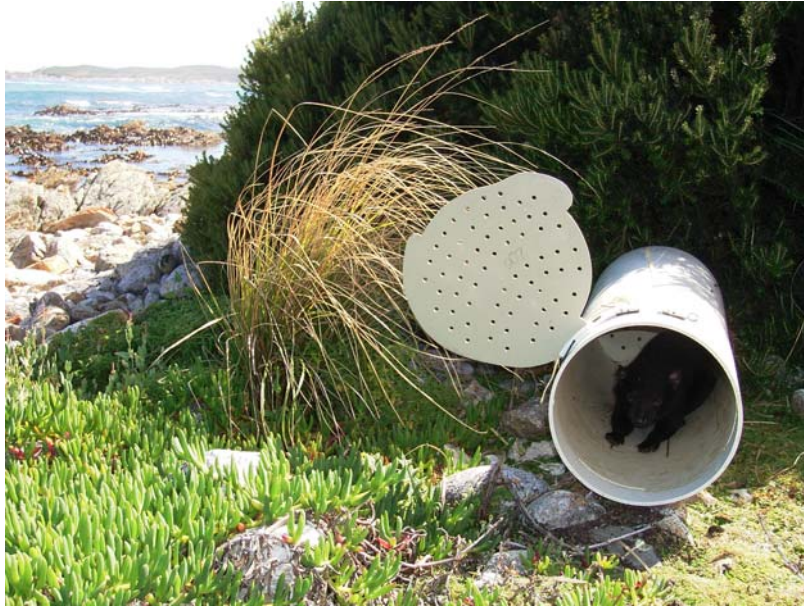
Figure 10: Tasmanian devil in PVC trap