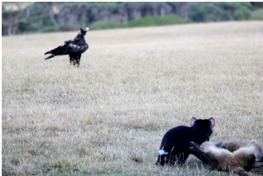
Figure 3: Tasmanian devil with prey and wedge-tailed eagle

A high number of juvenile devils (up to 60%) do not survive to adulthood, but the reasons for this are unclear. Juvenile devils are similar to adults, except for being more agile — they can climb small trees and jump to a degree (a feature of adult devils is that they cannot jump upward). Young devils are potential prey for wedge-tailed eagles ( Aquila audax fleayi ) (Figure 3), masked owls ( Tyto novaehollandiae ) and spotted-tailed quolls ( Dasyurus maculatus ), and many are killed by poorly controlled domestic dogs. Previously thylacines would likely have been a significant predator of devils of all ages. Tasmanian devils compete with spotted-tailed quolls and may be the reason for low densities of spotted-tailed quolls in some areas (Glen and Dickman, 2005). Devils can live up to seven to eight years of age, but most only live to five to six years in the wild.