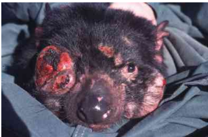
Figure 5: Devil facial tumour disease in a Tasmanian devil

Devil facial tumour disease is a lethal, infectious cancer. In infected areas, nearly all animals over two years old, and some younger animals, contract the disease. It causes lumps or lesions (swollen, broken or bleeding areas) in the mouth, or on the face or neck. The lumps grow into larger tumours in, or just under, the skin (Figure 5).