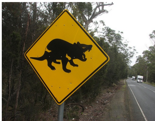
Figure 9: Tasmanian devil road warning sign