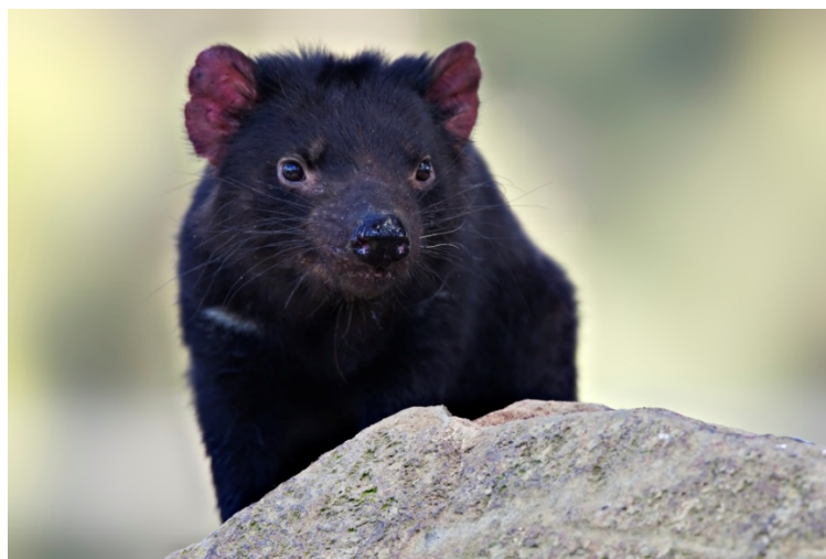
Figure 1: Tasmanian devil

This Recovery Plan outlines the measures required to: maintain a disease-free insurance population; manage and protect Tasmanian devils in the wild; maintain the genetic diversity; and manage habitats to allow for the re-establishment of Tasmanian devils. This is the first Recovery Plan for the Tasmanian devil, and it has been influenced by the successes and challenges of the Save the Tasmanian Devil Program.