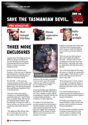
Figure 11: Save the Tasmanian Devil Program newsletter