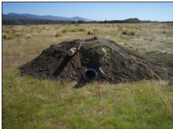
Figure 8: Artificial den in free-range enclosure

The PHVA workshop (CBSG 2008) discussed the social and environmental aspects of many offshore islands. The 'Islands Working Group' concluded that although the larger islands are more likely to be successful in terms of minimising management and maximising population size, smaller islands should not be discounted. DPIPWE is investigating the feasibility of releasing devils on offshore Tasmanian islands to create new disease-free populations. This includes developing a process to evaluate the risks and benefits to both devils and the natural values of islands.