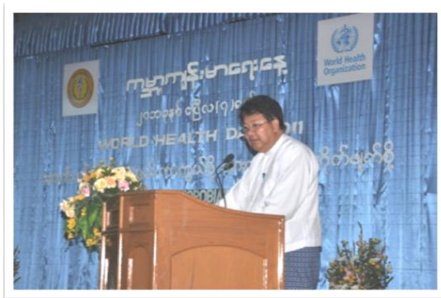
HE Professor Dr Pe Thet Khin, Union Health Minister delivered an inaugural speech at 2011 World Health Day Commemoration Ceremony

The Ministry of Health is headed by the Union Minister who is assisted by two Union Deputy Ministers. The Ministry has seven functioning departments, each under a Director General. They are Department of Health Planning, Department of Health, Department of Medical Science, Department of Medical Research (Lower Myanmar), Department of Medical Research (Upper Myanmar), Department of Medical Research (Central Myanmar) and Department of Traditional Medicine. All these departments are further divided according to their functions and responsibilities. Maximum community participation in health activities is encouraged. Collaboration with related departments and social organizations has been promoted by the ministry.