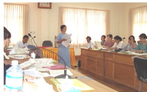
Training of Trainers on Multiple Indicators Cluster Survey