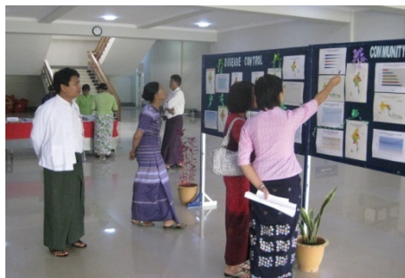
Health Information Display in Central Evaluation Meeting