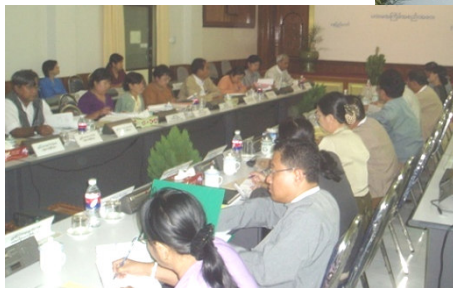
National Health Plan (2011-2016) Formulation Meeting