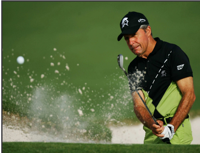
10-time SA Masters winner, Gary Player

The title sponsor Nashua has a long standing relationship with the Sunshine Tour and Sun International, specifically with the host venue, the Wild Coast Sun Country Club, having previously sponsored events such as the Nashua Skins and the Nashua Wild Coast Sun Challenge.