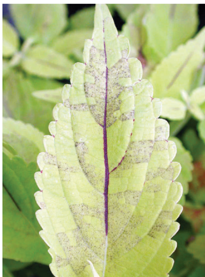
Grayish, speckled patches may appear on downy mildew-infected coleus leaves under humid conditions.

Keeping seed-grown coleus separate from cutting-grown coleus will be especially desirable. ♦