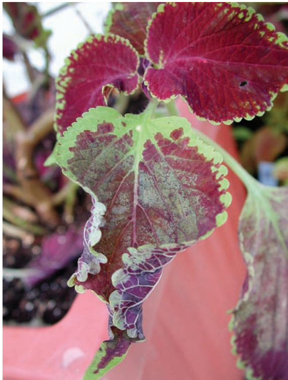
Leaf curl is just one symptom of downy mildew on coleus.