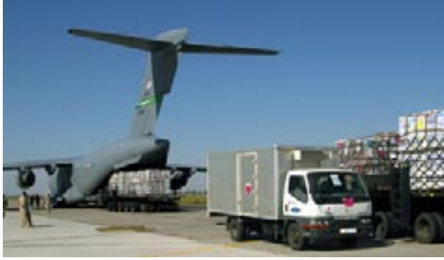
Manas Air Base, Kyrgyz Republic — Trucks line up as Operation Provide Hope aid is unloaded from a U.S. Air Force C-17 Globemaster III from McChord Air Force Base, Washington. More than $15 million worth of medicines and medical supplies were flown in.

Since 1985, the Denton Amendment has facilitated the use of U.S. military aircraft to be used to transport humanitarian relief supplies and related cargo on a space-available basis in support of assistance programs. As a result, thousands of tons of cargo have been delivered, not only for U.S. government agencies but also for the United Nations, nongovernmental organizations, and private charities. Several years ago, for example, a U.S. Army officer working in Ukraine decided on his own to equip several medical clinics in small towns around the country. After soliciting donated equipment while on leave in the United States, he coordinated free transport under the Denton Amendment and practically established three Ukrainian medical facilities single-handedly.