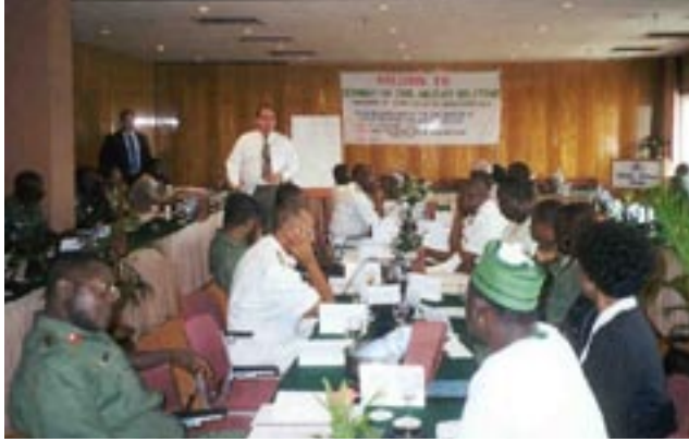
Faculty from the Center for Civil-Military Relations of the U.S. Naval Postgraduate School conducts classes in Nigeria.

foreign nations in resolving civil–military issues that can occur as a nation addresses defense transformation requirements, participates in stability and support operations, seeks to combat terrorism, and steps up to other security challenges.