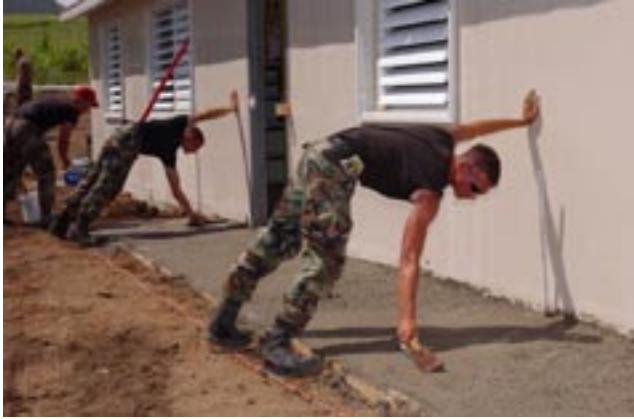
U.S. military engineers smooth a cement sidewalk adjacent to a health center in St. Kitts and Nevis, a federation of islands in the Caribbean Sea. Army National Guard, Air Force, Army Reserves, and Marine Corps units worked in conjunction with the St. Kitts and Nevis Defense Force in a 2003 exercise known as New Horizons.

benefits accruing to countries that have a viable reserve force of ordinary citizens trained and motivated to answer their country's call to duty in emergencies. The U.S. National Guard is ready, as needed, to organize, staff, train, and equip an effective military reserve force to ensure civilian control of the military.