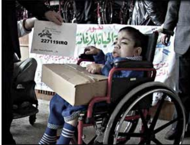
An Iraqi child operates his new wheelchair, donated through a public-private partnership.