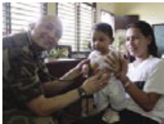
A U.S. Army nurse assigned to Joint Task Force 510 examines a young Filipino child in Bunguiao Barangay of Zamboanga City during Operation SMILES' 20 Medical Civic Action Project that provided medical help to the people in Mindanao and Basilan Island areas.