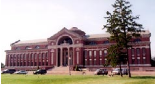
With facilities located in Washington, D.C., and Norfolk, Virginia, more than 1,000 military and civilian students attend National Defense University courses and programs on any given day. NDU, an accredited graduate-level university, awards more than 500 masters degrees to those who complete studies at the National War College and Industrial College of the Armed Forces every year. Through agreements with a number of universities, Information Resources Management College students can earn 15 graduate credits for work completed at NDU. Pictured above is the National War College on the NDU campus.

coordinated from the ground up. This is best accomplished when there is common understanding on skills and procedures among participants at all levels.