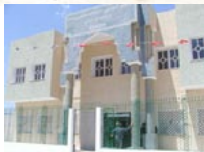
The Social Assistance Center for Mentally Handicapped Children in Sidi Bou Ali, Tunisia, which was constructed with financial support from the U.S. Department of Defense Humanitarian Assistance Program and assistance from the U.S. Embassy.

producing handicraft work. The most amazing results were revealed when some students were successfully integrated into the public school system.