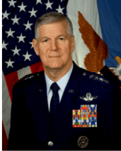
General Richard B. Myers Chairman, Joint Chiefs of Staff

T he dynamic and challenging nature of the current security environment makes cooperation within the international community more important than ever. We face a wide variety of threats to peace: from weapons of mass destruction, to terrorism, to natural disasters. Humanitarian assistance and foreign military training are valuable means of building constructive, long-term relationships across the globe: partnerships that encourage stability in regions faced with unique challenges. Offering nations the tools for self-sufficiency, self-protection, security, prosperity, and self-government are shared responsibilities.