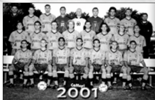
The 2001 Sacramento State squad captured the program's first Mountain Pacific Sports Federation regular season title with a school-record conference mark of 4-1-2. The team also received six all-MPSF selections, one all-tournament selection and one all-Far West Region selection.