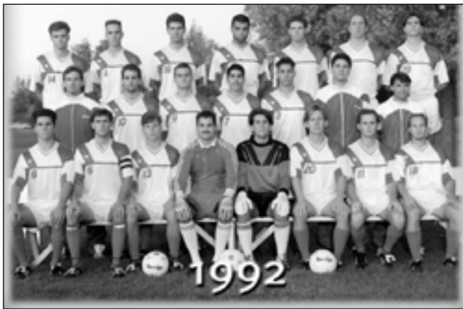
TEAM STREAKS Besides holding the program's best overall record since the Division I era began in 1991 (10-5-3), the 1992 squad is also tied for the most consecutive shutouts in a season (three).