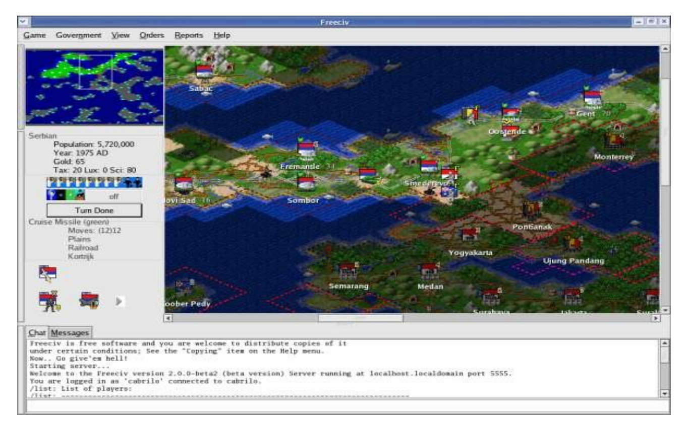
Figure 1: Screenshot of Freeciv user interface [9].

In Freeciv, cities are the fundamental elements of a civilization. Cities can extract resources from the map square that they are located on, plus N nearby squares where N is city size (initial value one) [10]. To obtain a resource a worker has be assigned to an unused resource square. This is done automatically by the game or can be adjusted manually via the city management screen.