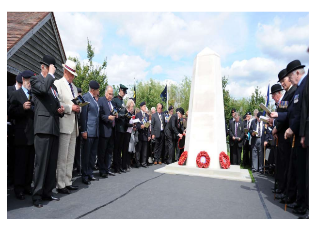
Dedication of the Regimental Memorial at the NMA on 12th July 2012

"Today we are gathered together in the presence of God at the National Memorial Arboretum to dedicate this memorial to the fallen of The Royal Gloucestershire, Berkshire and Wiltshire Regiment and our antecedent Regiments - The Gloucestershire Regiment, The Duke of Edinburgh's Royal Regiment, The Royal Berkshire Regiment and The Wiltshire Regiment. As comrades and family and friends, I welcome you, and pray that together we shall honour their memory."