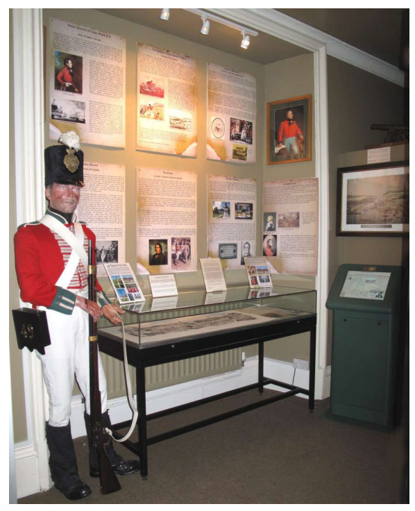
The exhibition marking the bicentenary of the War of 1812 and celebrating the life and achievements of General Sir Isaac Brock of the 49th

Seven months earlier The Wardrobe had been setting for another reception, this time for the charity DecAid, a name chosen to mark 10 years of military involvement in Afghanistan. A national appeal set up by a team of students from Exeter University, Decaid had 3 aims: to increase awareness of the work and involvement of the Armed Forces in Afghanistan, to remember those men and women of our Armed forces who have lost their lives serving in Afghanistan, and to raise over £350,000 for two service charities, BLESMA and SSAFA Forces Help, who work with casualties from Afghanistan. The Duchess of Cornwall was their Royal Patron, and HRH attended their final reception held at The Wardrobe on 2<sup>nd</sup> October 2011.