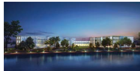
Whirlpool New Downtown Campus

Lastly, Epstein is currently serving as architect of record for Arquitectonica on the design of Whirlpool's New Downtown Campus in Benton Harbor, Michigan. This three phased development includes 250,000 square feet of new offices, conference/dining facilities; 10,000 square feet of retail; and 600,000 square feet of interior renovation of Whirlpool's current facilities in Benton Harbor from where personnel for the new Headquarters are being moved.