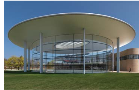
Fortaleza Hall and The Commons