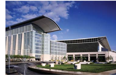
McCormick Place Convention Center South Hall

Following the museum project, Epstein worked on two significant urban projects, the 2,900,000 square foot McCormick Place Convention Center South Hall (1991 - 1997) with Tom Ventulett of Thompson, Ventulett, Stainback & Associates ( TVS ) and the 1,300,000 square foot Midway Airport New Passenger Terminal (1995 - present) designed with HNTB . These projects which came on the heels of one another