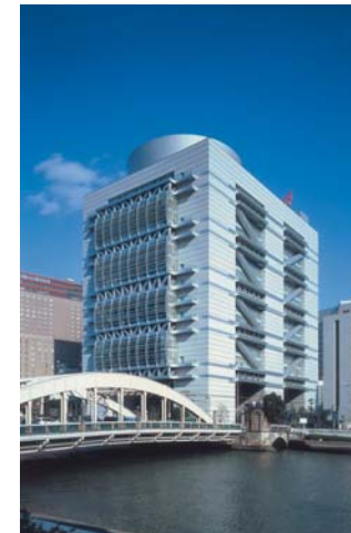
Grand Cube Osaka

Kisho Kurokawa for the design and engineering of the Grand Cube Osaka/Osaka International Conference Hall (1995 - 1997) in Osaka, Japan. Epstein completed another significant international project, the 32-story Warsaw Financial Center , with the office of Kohn Pederson Fox in Warsaw, Poland from 1995- 1998. Epstein also teamed with Santiago Calatrava (2000 - 2001) for the schematic design of a proposed Queen's Landing pedestrian bridge linking Chicago's Grant Park/Buckingham Fountain with the Lake Michigan shoreline. In early 2005, Epstein completed the Hyatt Center (2002 - 2005), a 1,800,000 square foot, 48-story high-rise located in Chicago with Pei Cobb Freed & Partners . This office