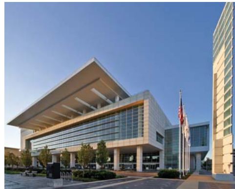
McCormick Place Convention Center West Expansion

Poland had its grand opening. Epstein teamed with The Jerde Partnership on this project to help produce this one of a kind development. In August of 2007 Epstein completed the McCormick Place Convention Center West Expansion (2003 - 2007). This project involved expanding the McCormick Place campus by an additional 2 million square feet and once again we are teamed with TVS on this significant development.