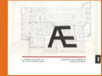
Issue #1 - 1958

Epstein's Design Profile is a brief in-house publication addressing our recent design and construction projects and discussing today's industry challenges.