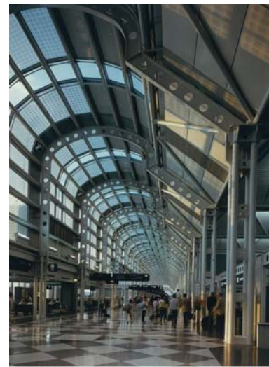
United Airlines Terminal 1