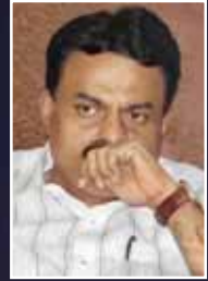
Mayor Sunil Prabhu

"Mumbai is expanding, or say developing rapidly". "In order to reduce traffic congestion & deaths in local trains due to over-crowding, we have sent a proposal to the state and central government to connect Link and SV Road to Vasai-Virar. We are eagerly waiting for their approval so that work on it can be started as soon as possible." "This will help to divert the traffic to other section of the city. Also property rate would be stable." "In order to be with the pace of development, major projects are under completion. We got 16 tunnels under construction to supply water to our city. We got projects worth 1450 Crore for over bridges all across the city." "You are living in a developing city like Mumbai where in you earn good money, so then how can you expect real estate to give cheap houses? Ask Mayor Sunil Prabhu