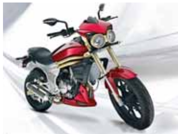
Triumph Daytona 675

Expected Price: Rs. 2 lakhs Launch: Late-2013 What to expect: Performance oriented 200cc bike with cutting edge styling.