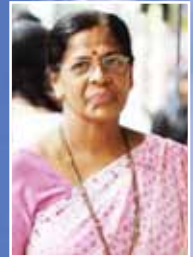
Mayor Vaidehi Naik

Being a new formed corporation we are in the process of formulating effective bye-laws by which we would hand able to make administration more citizens friendly. We have also more project to complete state of the art Municipal market project, the design of which have been drawing up. The city has also formulated the plans for the bus rapid system for the city. The initial work for this project has been completed. It is proposed to submit the project for JNNURM filling this move will help in alleviating in the market problem as well as pedestrian and ease conjunction in the city.