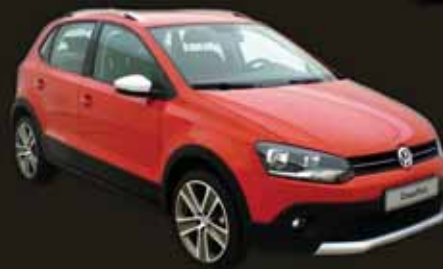
Volkswagen Cross Polo

Expected Price: Rs. 10 lakhs Launch: November 2013 What to expect: Stop gap measure to compete in compact SUV space till Taigun arrives.