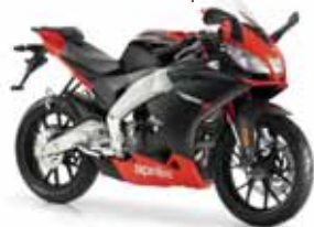
Aprilia RS200 4-Stroke

Expected Price: Rs. 2 lakhs Launch: Late-2013 What to expect: Performance oriented 200cc bike with cutting edge styling.