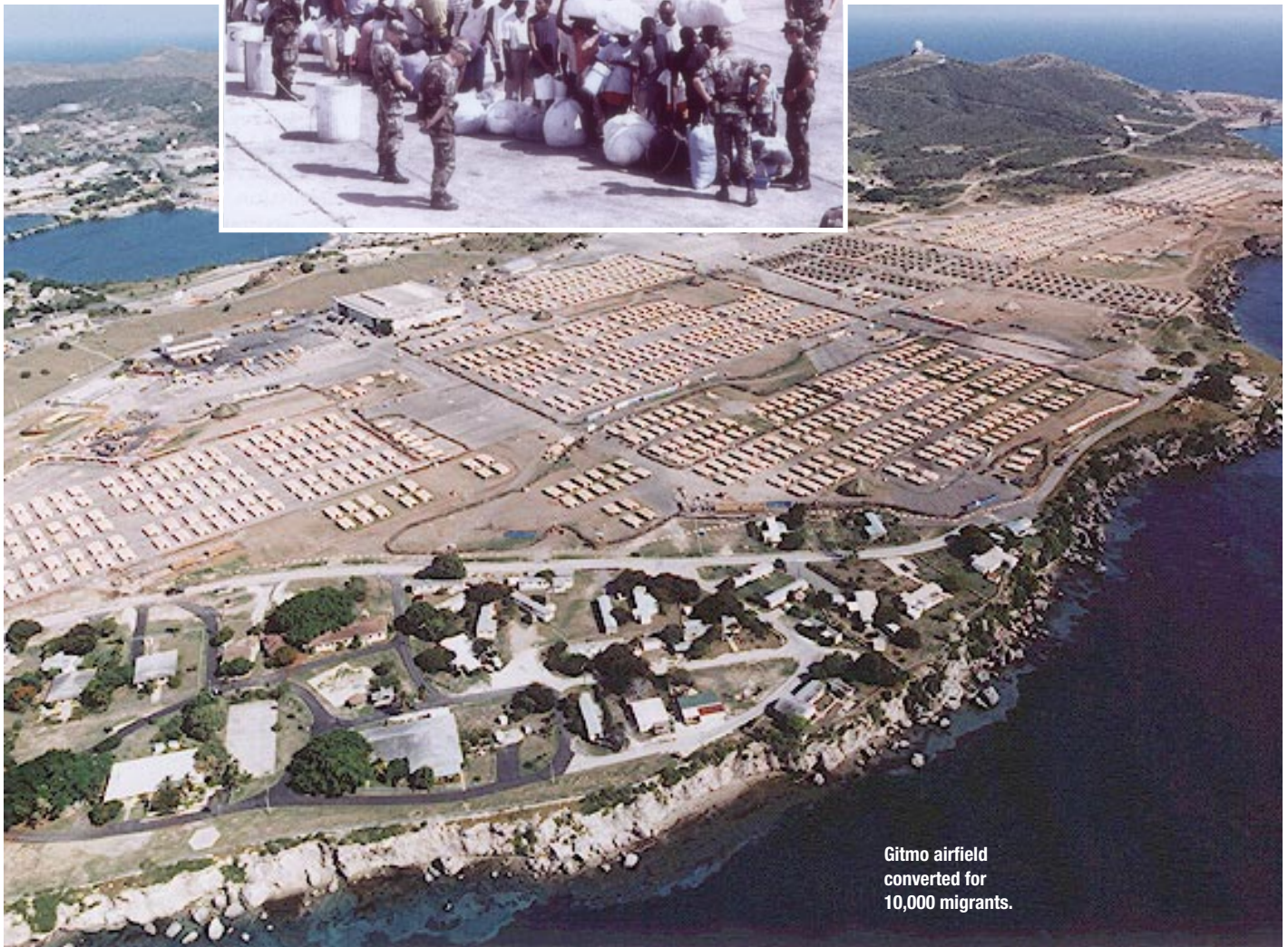
Citmo airfield converted for 10,000 migrants.

On arrival, Cuban refugees were typically put in camps to await processing at the migrant processing center. Because of a lack of vehicles, some refugees took up to two weeks to reach the center. As Coast Guard and Navy vessels continued to pick up rafters at record rates, off-loading and transporting migrants impacted on vehicular support between the camps. JTF-160 initiated a database known as the deployable mass population identification and tracking system (DMPITS), consisting of a five-station processing center. Fully staffed, it could process 1,500 migrants per day, although the average was between 800 and 1,200.