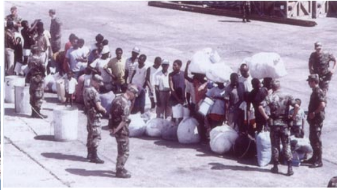
Haitians await volunteer repatriation.

ting up both formal and informal relationships with their Army counterparts, active and Reserve. In future operations the Marine Corps should assign CA liaison officers to CINCs as well as to Army civil affairs commands. This would lead to a better appreciation of the unique CA capabilities of both services and facilitate training among active and Reserve civil affairs units.