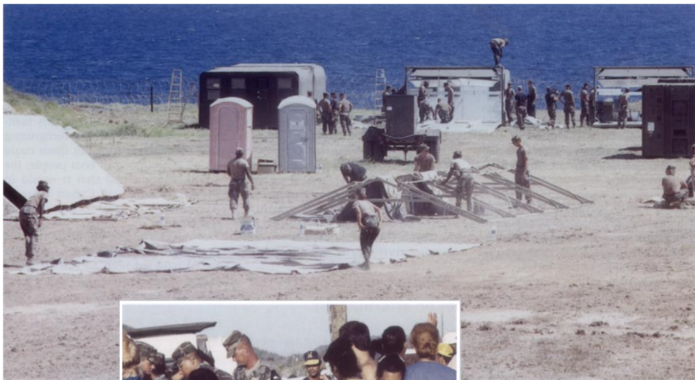
Erecting tents to house JTF-160 personnel.