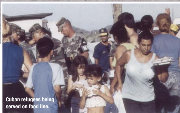
Cuban refugees being served on food line.

Shortly after the August 1994 demonstrations, the migrant camps were designated as being for single males, families, or unaccompanied minors, although single females and married couples still were housed with single men in many cases. The maximum population of each camp was set at 2,500. In October 1994, additional sub-camps were created to segregate Cubans who wanted to be repatriated or relocated to Panama. Moreover, MAG 291 and Camp X-Ray were established to administratively segregate those who endangered the safety and welfare of others. Those migrants who committed infractions were moved to MAG-291 for 7–30 days. Felons and those who posed serious and documented threats went to Camp X-Ray