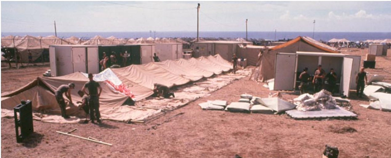
JTF-160 setting up air transportable hospital.