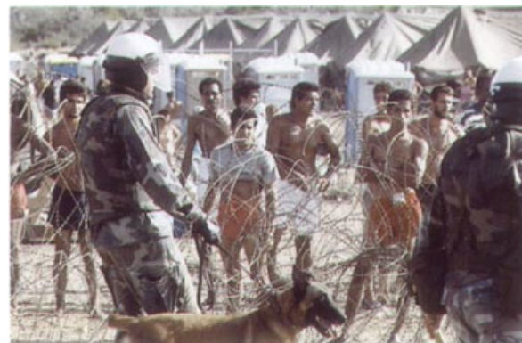
Military police patrolling refugee camp.

The camps were being constructed and filled to capacity in a matter of days, with command then turned over to incoming military police units. Was Sea Signal really a military police mission? Refugees, furious over living conditions and the abrupt change in immigration policy, complained, demonstrated, and eventually rioted.