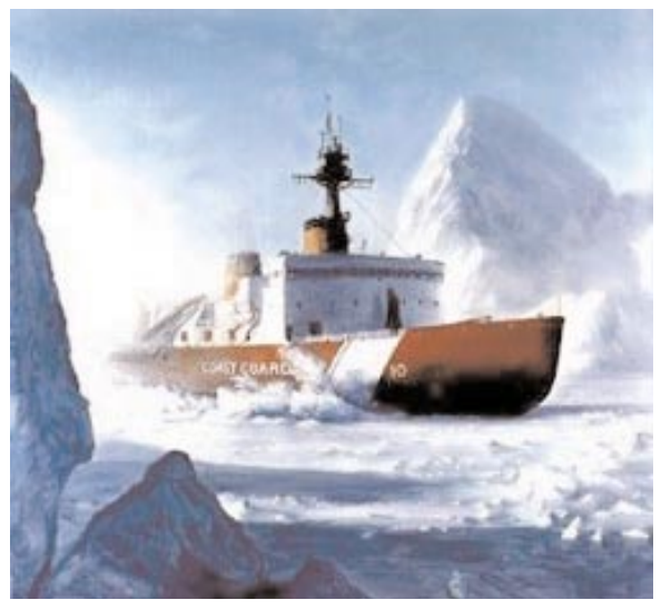
US Coast Guard cutter, Polar Star.

Scientists will deploy the TROV from aboard the US Coast Guard cutter, Polar Star, one of the world's most powerful non-nuclear icebreakers, which will depart from Seattle and travel north along the Canadian and Alaskan coasts to Point Barrow. During its journey, the Polar Star will pass through the waters near Icy Cape, where the New Bedford whaling fleet sank in September of 1871 after becoming trapped in the ice and abandoned.