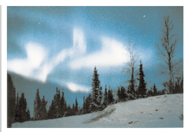
The Aurora over artic regions

The aurora is a dazzling light display that occurs in the upper atmosphere above about 100 km altitude in the arctic regions of the Earth. It is caused when charged particles from the Sun strike the region dominated by the magnetic field of the Earth (magnetosphere). Some of the energy is transferred to charged particles in the magnetosphere which race along the magnetic field and crash into the atmosphere. These collisions cause the atmospheric gases to emit the red, green, and blue light that forms the spectacular auroral displays that are visible from Earth.