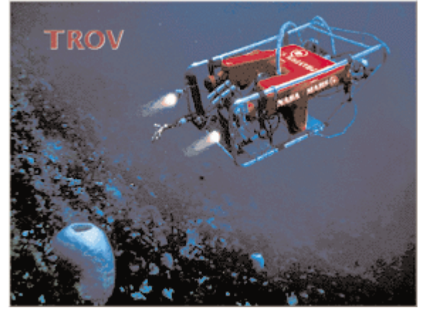
Credit: Example of a TROV, developed by ARC's IMG.

Using technology originally developed for the Mars Pathfinder (MPF), NASA scientists began a search in August of this year for a whaling fleet lost in 1871 beneath the frigid waters of the Arctic Ocean. Scientists from Ames Research Center (ARC), are using an underwater telepresence remotely operated vehicle (TROV) equipped with a pair of stereo video cameras to record underwater footage in 3D. Computer software developed for Pathfinder by the Intelligent Mechanisms Group (IMG) at ARC is being used to produce a virtual reality computer simulation of the underwater environment. Scientists believe these marine maps can be used for astrobiology hydrothermal vent research and for marine biology and archaeology research.