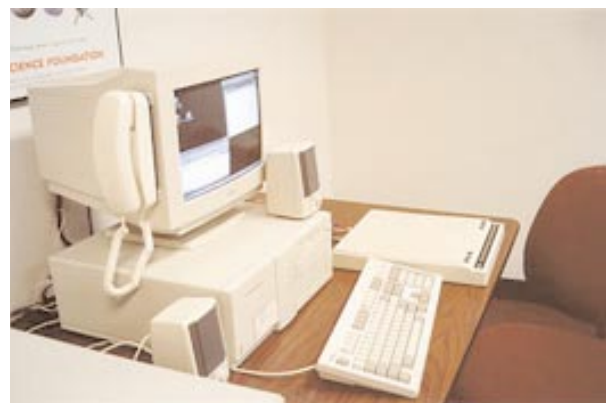
The project workstation.

Based on the feedback from a test group of deaf-blind users, the project team is confident that a market exists for such a system. Even with th limitation of the dictate system to speak isolated words, the team determined that the speed of conversation was still close to 50% of spoken conversations (100-150 wpm) and equivalent to interpreted conversation. The speech synthesizer is limited only by the typist's speed. Many enhancements are planned for future models.