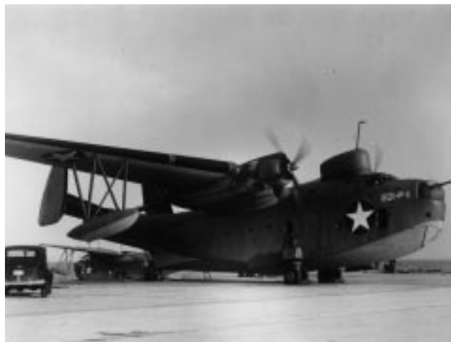
A squadron PBM-3C at NAS Banana River, circa December 1942, 80-G-383019 (Courtesy Captain Jerry Mason, USN).

1 Sep–1 Dec 1942: VP-201 was established at NAS Norfolk, Va., under the operational command of FAW-5, flying PBM-3 seaplanes. The squadron was sent on 6 October 1942 to NAS Banana River, Fla., where most of the operational unit training was undertaken. The squadron received its own PBM-3C aircraft fresh from the factory on 1 December 1942.