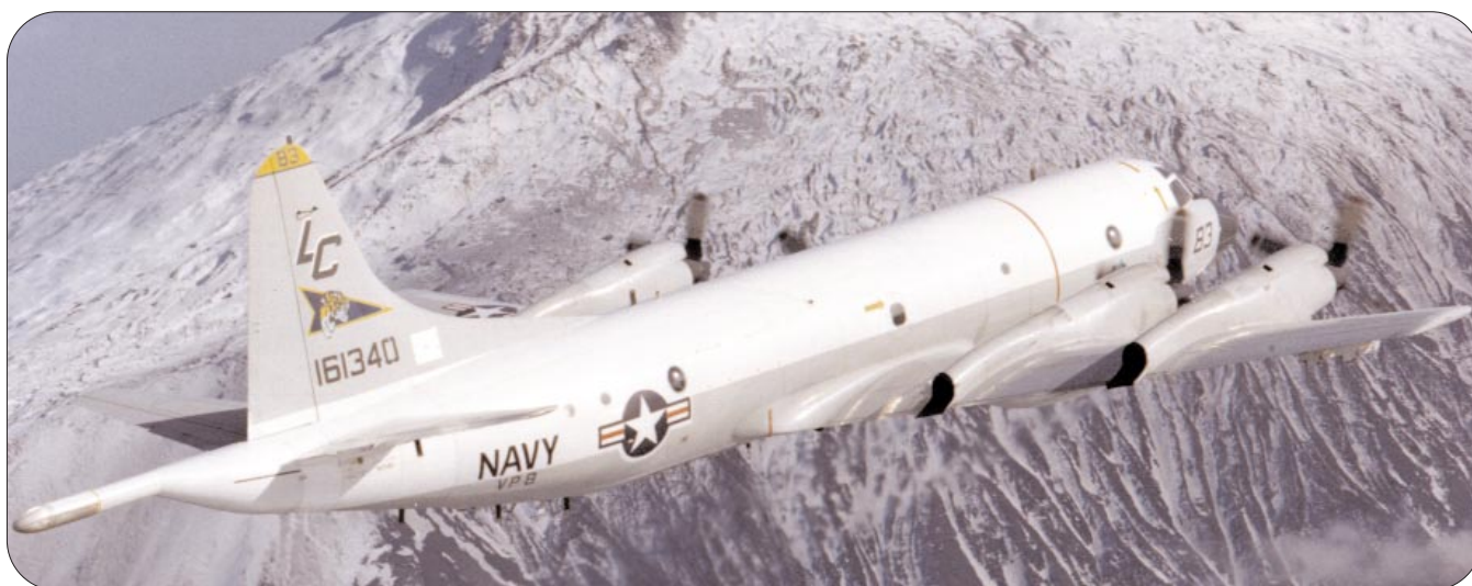
A squadron P-3 in flight.