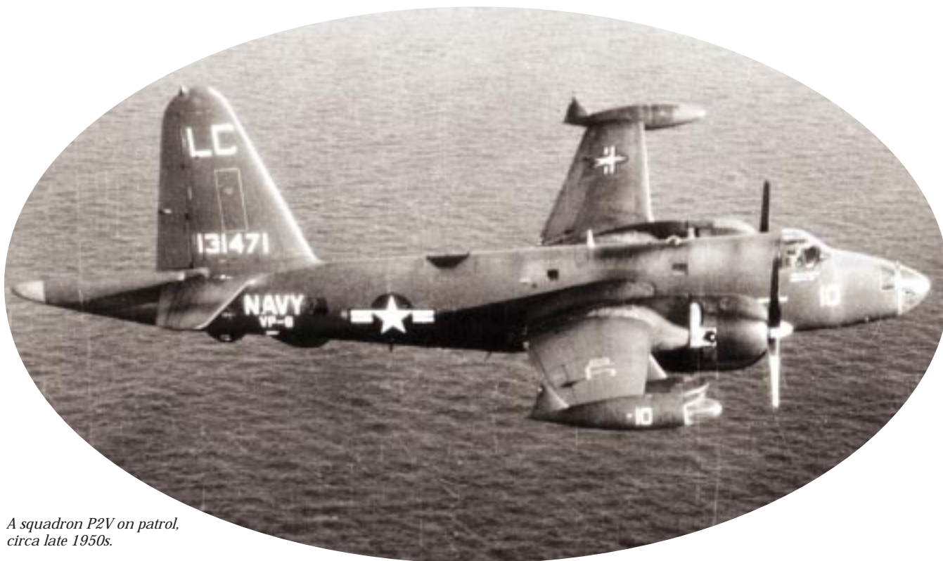
A squadron P2V on patrol, circa late 1950s.

Barter Island, Alaska, to Thule, Greenland. These DEW Line stations called for highly skilled, dedicated technicians who could man them without regard to weather, absence from family and boredom. The DEW Line began test operations in 1953 and was completed by 1955.