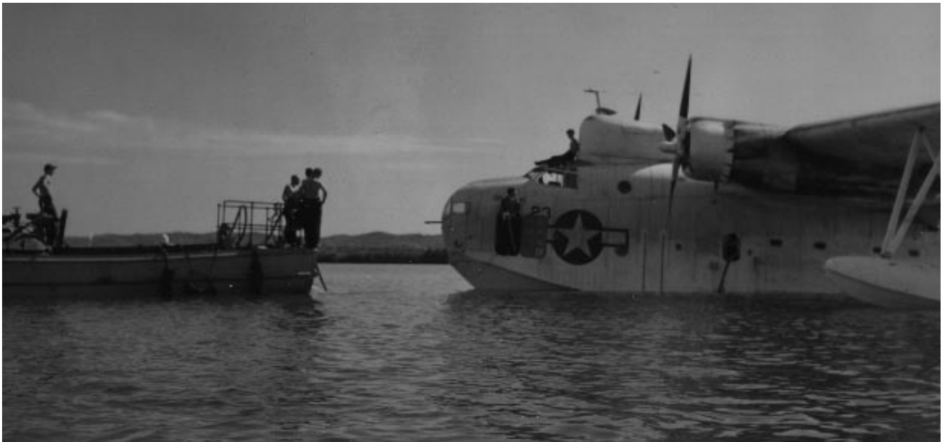
A squadron PBM being refueled from a barge in Guantanamo Bay, Cuba, January 1945, 80-G-304438.

tional control of FAW-3. The squadron engaged in ASW, searchlight tactics, gunnery, bombing, and instrument training flights. Following the end of World War II, the squadron's aircraft inventory was reduced from 15 to 9 and it also experienced a reduction in personnel due to the postwar demobilization.