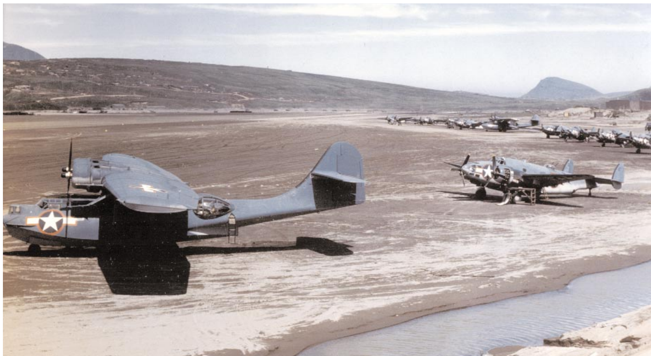
In the right foreground is a PV-1 Ventura with several other PV-1s on the flight line of an Aleutians airfield in the summer of 1943. The photo also shows several PBY-5As. The PBYs are not part of the squadron's complement. The squadron had transitioned from the PBY to the PV-1s in February 1943, 80-G-K-8133.

14 Jun 1944: VB-135 aircraft conducted daylight photoreconnaissance over Paramushiro and Shimushu, resulting in the loss of two aircraft damaged and forced to land in Russian territory. The crews were interned by the Soviets for several months.