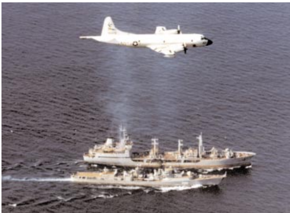
A squadron P-3B flying over two Soviet ships, 1975.

2 Dec 1990: VP-8 deployed to NAS Sigonella, Sicily. During the period of Operation Desert Shield