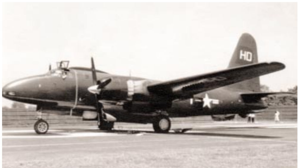
A squadron P2V, circa 1949.

15 Jul 1955: VP-8 marked its first deployment to Argentia with new P2V-5Fs. During the deployment detachments operated from Goose Bay, Labrador; Frobisher Bay and Thule, Greenland, flying ice patrol. They also provided cover for convoys carrying supplies to the new Dew Line sites. The Distant Early Warning (DEW) Line stretched more than 3,000 miles across the 69 th parallel, spanning the frozen north from