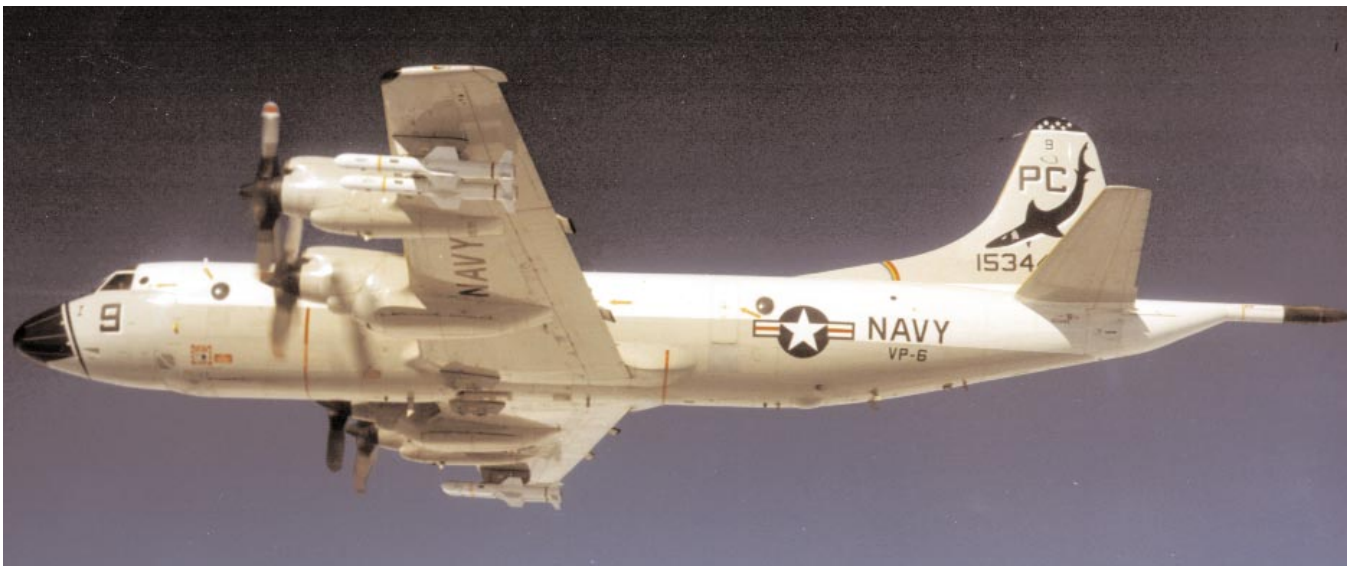
A squadron P-3C loaded with Harpoon missiles, 1984.

Nov 1980: The squadron deployed to NAS Cubi Point, R.P., as the first Pacific fleet squadron to deploy with full Harpoon missile capabilities. Throughout the deployment a detachment was maintained on the island of Diego Garcia.