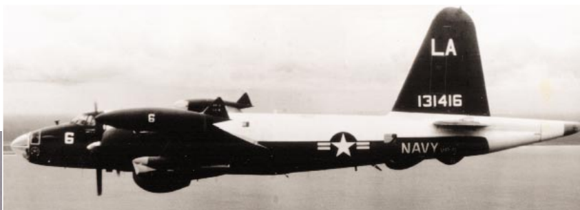
A squadron P2V Neptune on patrol in January 1962.