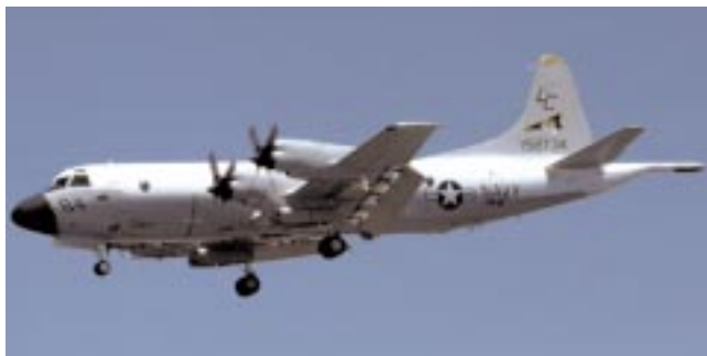
A VP-8 P-3B on approach to NAS Moffett Field in June 1981.

the squadron was tasked with monitoring Russian, Libyan and Iraqi vessels in the Mediterranean that might attempt to circumvent the UN embargo of Iraq. A three-aircraft and three-crew detachment was established at Jeddah, Saudi Arabia, to assist in operations monitoring the Gulf area of operations. With the beginning of hostilities during the Operation Desert Storm phase of the war, the Jeddah detachment flew 93 combat support missions totaling 830.5 flight hours.