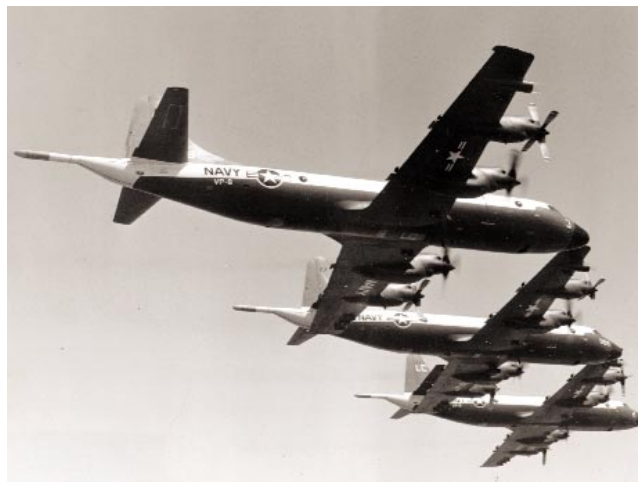
A formation of the squadron's new P-3As, August 1962.

1964: VP-8 flew convoy ASW operations support of Fleet Exercise Steel Pike I, operating from the east coast of Spain and alternating with VP-49 and VP-44. It marked the first occasion that land-based escorts had