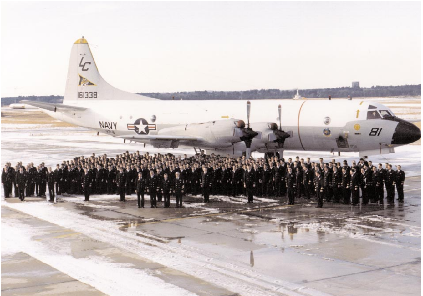
A photo of VP-8 personnel and its P-3 in the background.