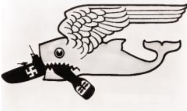
A copy of the full design of the first insignia.