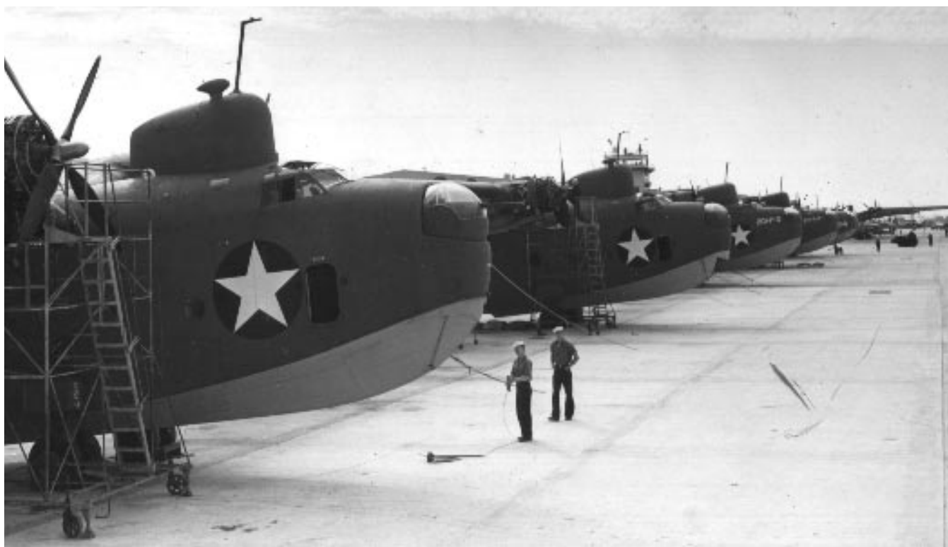
Squadron PBM-3Cs on the ramp at NAS Banana River, 80-G-33231.

Convoys to and from Europe were covered in a radius of 500 miles from Bermuda.