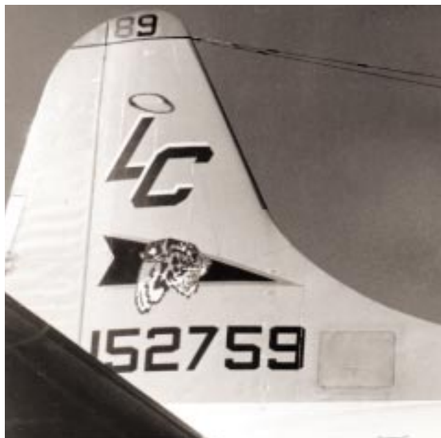
A close up of a squadron P-3 tail showing the squadron's fifth insignia and its tail code LC.