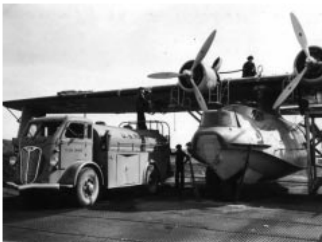
A PBY being refueled in preparation for a patrol in Alaskan waters, 80-G-17852.