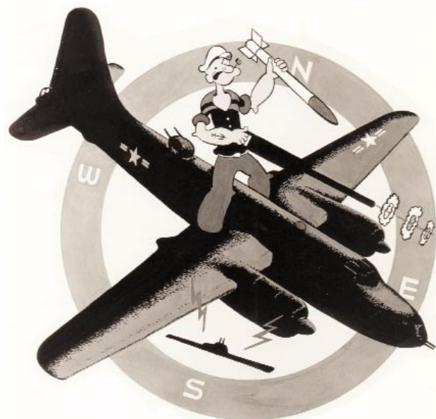
This insignia is the more formal design of Popeye and the P2V.

was developed from a design prepared by Bradley Kelly of King Features Syndicate. It was approved by CNO on 3 June 1947. Since the squadron had transitioned from the PV-2 Harpoon to the P2V-1 Neptune, the design featured the Neptune aircraft straddled by the cartoon charter Popeye, holding an aircraft rocket and a 50-caliber machine gun while flying above the silhouette of a submarine. Colors: inner circle, yellow; outer circle, orange; lettering, yellow; plane, blue; star on plane, white with red and white stripe; rocket, white with red head; machine gun, black with red flame and white smoke; submarine, black; Popeye, blue sailor pants with yellow belt, black blouse with yellow buttons, red and black collar and blue cuffs and a white cape; pipe, red. This insignia was used by VP-ML-6 only.