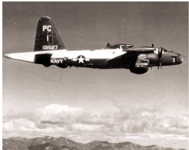
A squadron P2V in flight.

30 Jan 1948: VP-ML-6 began transition training to the P2V-2 at NAAS Miramar, Calif.