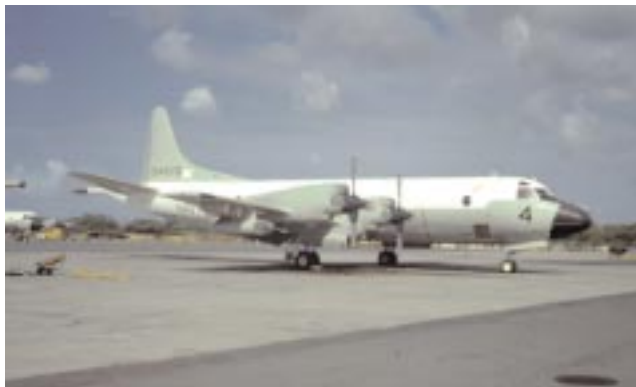
A VP-6 P-3B(Mod) at NAS Barbers Point in April 1979.

Aug 1977: Upon return from its 1976–1977 deployment, the squadron began the update program from the P-3B to the P-3B TAC/NAV MOD Super Bee. The retrofits to the P-3B airframes included more powerful engines, improved navigation equipment and upgraded avionics.