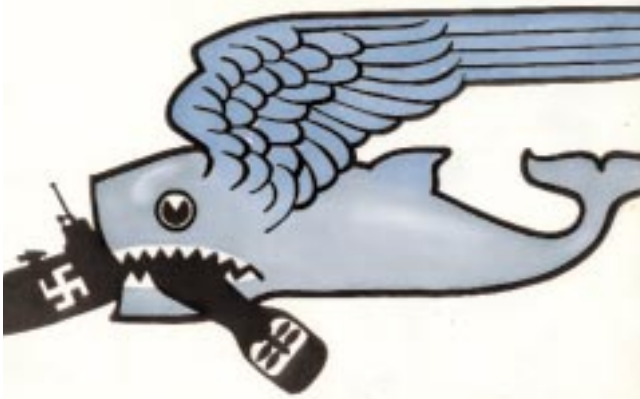
The squadron's first insignia. Unfortunately, someone clipped the design to make it fit into a file folder.

The first insignia adopted by VP-201 shortly after its formation in 1942 used the motif of the whale. In the design a winged whale crushed an Axis submarine in its jaws. The shape of the whale vaguely suggested the side view of the PBM-3 aircraft used by the squadron.