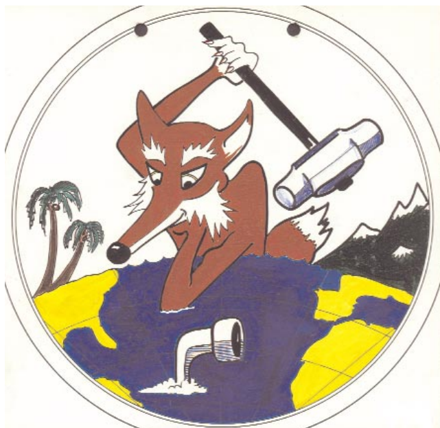
The squadron's current insignia, dating from the late 1940s continued the fox theme.

The fox theme was continued in the third version of the squadron insignia when the VP-ML-5 became VP-5 in 1948. There was no record of the date the new insignia was approved. The design was circular, with a central cartoon fox holding a sledgehammer in its raised right fist, preparing to strike a periscope emerging from the Atlantic area of the northern hemisphere of a globe. Two palm trees graced the left portion of