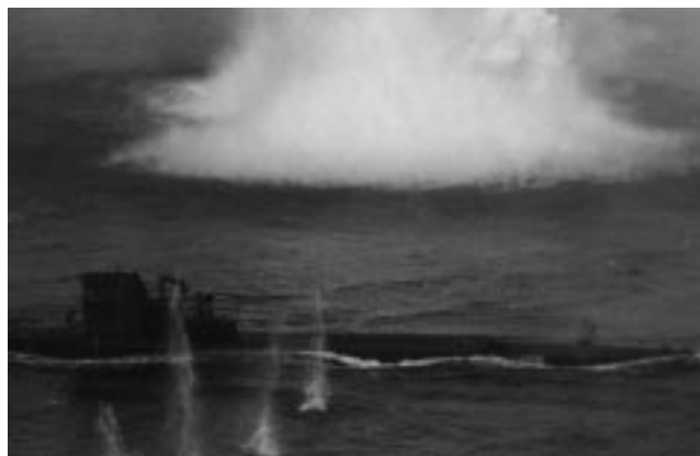
A squadron attack on a U-boat with depth bombs and machine gun. Note the men manning the submarine's machine gun. See the chronology entry for 9 July 1943, 80-G-205264 (Courtesy Captain Jerry Mason, USN).

27 May 1943: The PBM-3C aircraft flown by the squadron were replaced by a newer version with improved radar, the PBM-3S. After refitting, a six-aircraft detachment deployed to Bermuda. Patrols were flown ranging out to 800 miles, lasting 12 to 18 hours.