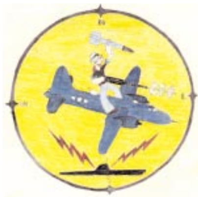
Popeye astride a P2V was the squadron's first approved insignia. This design is the hand drawn one submitted for approval by CNO.

There is no record of an approved insignia for VB-146, VPB-146 or VP-146. The squadron's first insignia