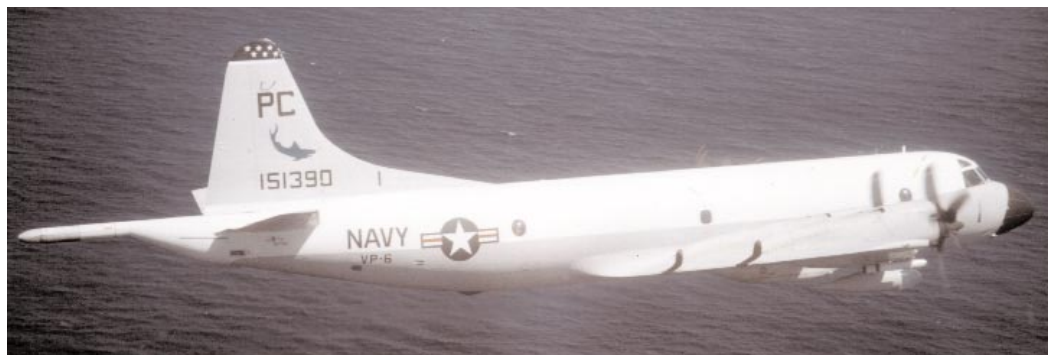
A squadron P-3C in flight.