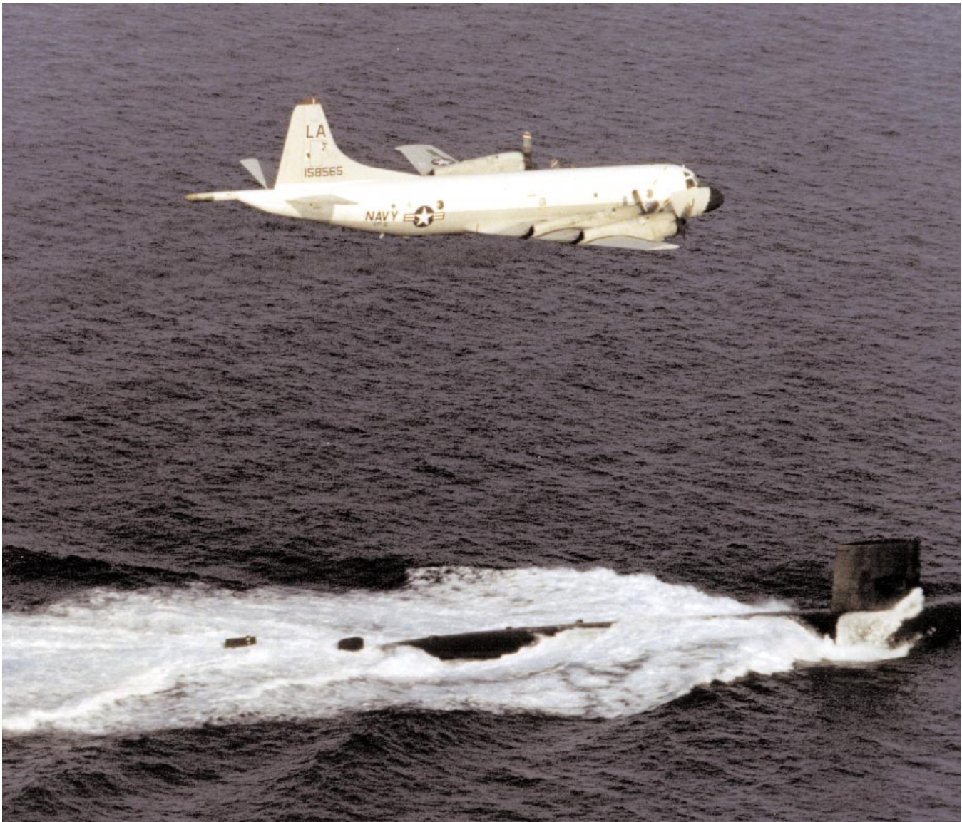
A squadron P-3C flying over a nuclear powered submarine, 1991.

3 Sep 1992: VP-5 deployed to NAS Keflavik, Iceland. During the deployment the squadron participated in anti-surface/mining operations with USAF F-15 aircraft. Ten different NATO countries were visited during this period, including the United Kingdom, Norway, Netherlands, France, Germany and Canada.