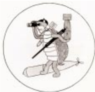
The turtle motif was used for the squadron’s second insignia which was approved by CNO in 1948.