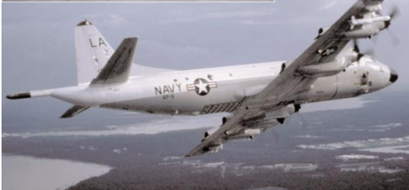
A squadron P-3 Orion in flight with a Harpoon missile under the wing.