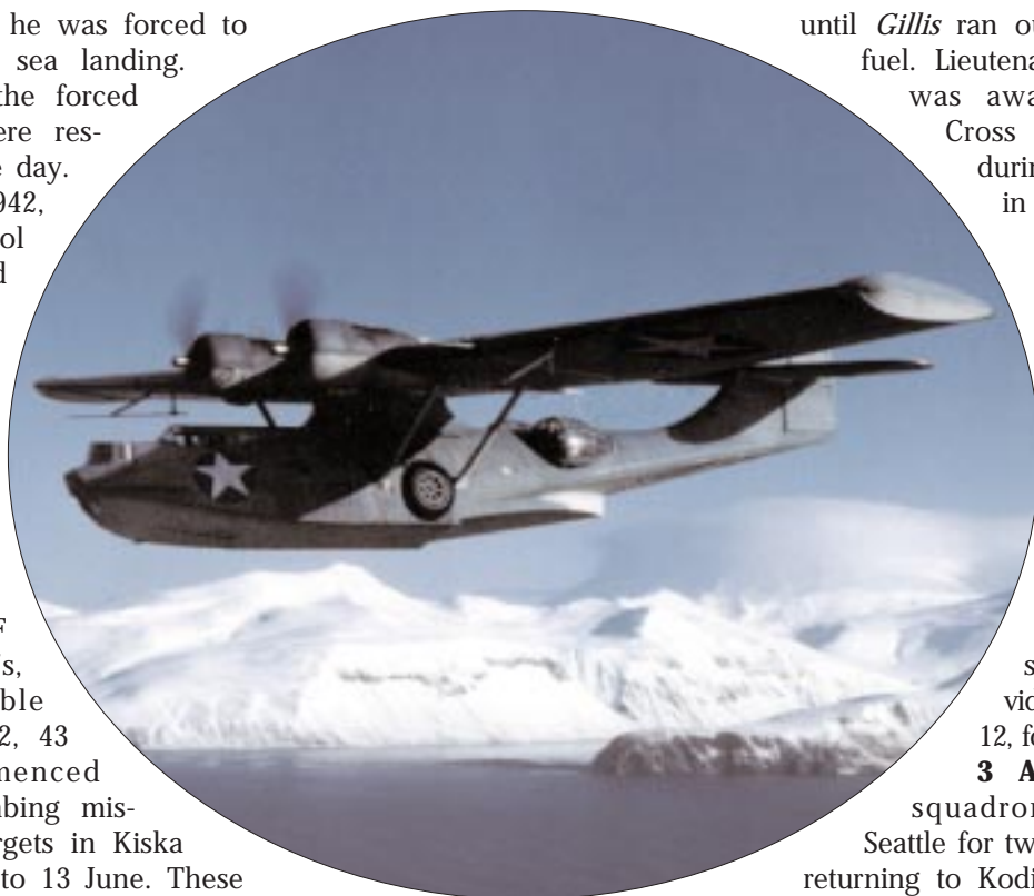
A PBY-5A flies a patrol near the snowy Aleutian Islands, circa 1942, 80-G-K-15433.

On 11 June 1942, Commander Patrol Wing 4 received a message from Commander in Chief Pacific which said, "bomb the enemy out of K i s k a . ." Following unsuccessful missions by USAAF B24s and B-17s, aircraft available from VPs 41, 42, 43 and 51 commenced continuous bombing missions against targets in Kiska harbor from 11 to 13 June. These missions became known as the "Kiska Blitz." During these bombing strikes the aircraft were serviced by Gillis (AVD 12) at Nazan Bay, Atka Island. Efforts to use the PBYs as horizontal bombers dropping their bombs from above the clouds proved futile. Pilots began attacking singly, approaching from a direction that provided the best cloud cover. When they were over the harbor the Catalinas were put into a dive and bombs released at the appropriate time. The flak was intense. A pullout was initiated at between 500 and 1,500 feet, and the plane immediately sought cover in the clouds. The raids continued