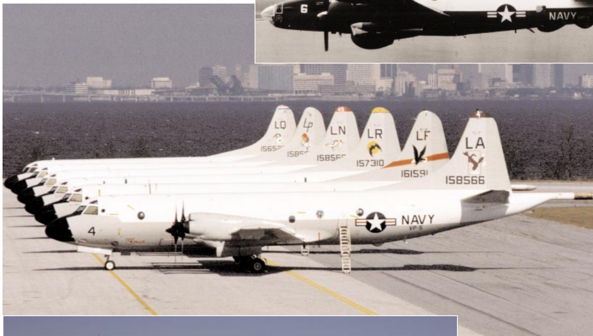
A squadron P-3 Orion in the foreground with five other squadron P-3s lined up on the tarmac at NAS Jacksonville.