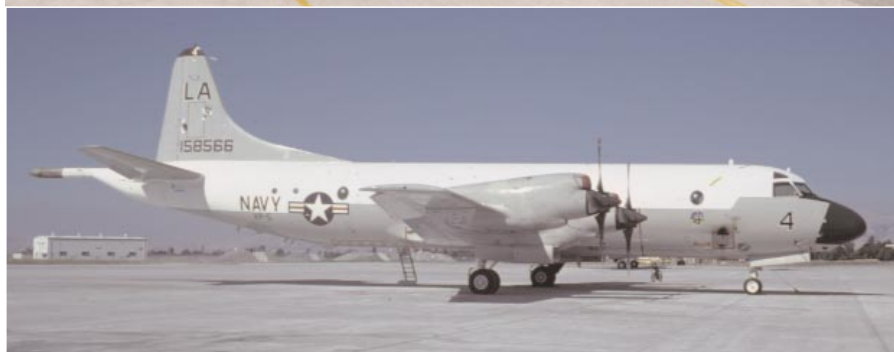
A VP-5 P-3C at NAS Moffett Field in June 1979.