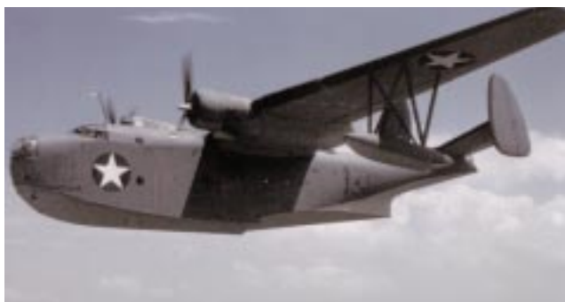
A PBM-3 Mariner on patrol, circa 1942-1943, 80-G-K-13517.

29 May 1945: VPB-201 was transferred to a new home port at NAS Coco Solo, C.Z., under the opera-