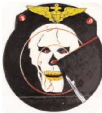
The skull design became the squadron’s third insignia.

and defensive capabilities of the P2V-2 in accomplishing its mission.