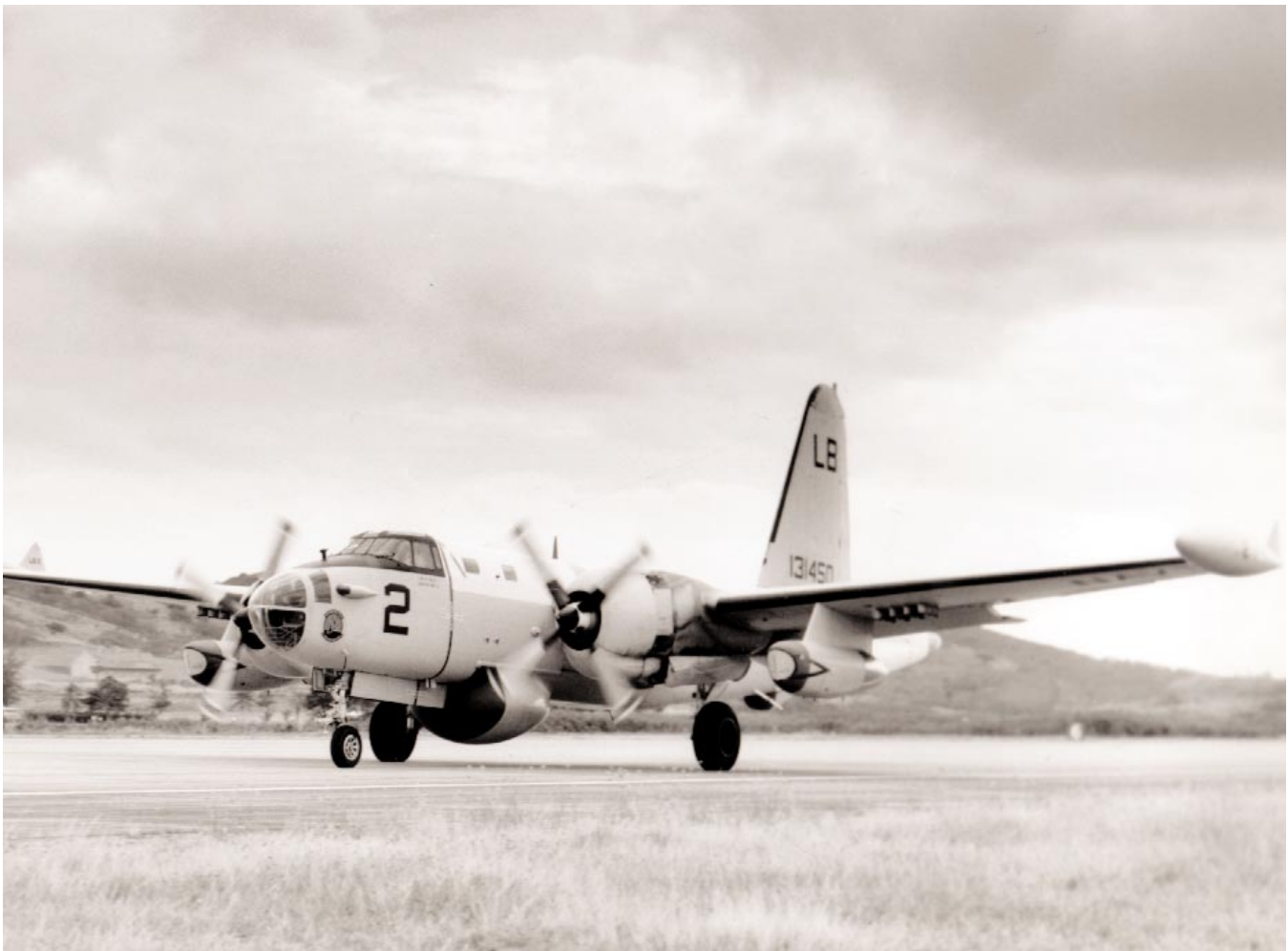
A squadron SP-2H lands at Naval Station Roosevelt Roads for an annual exercise in the Caribbean, 1965.