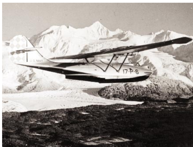
A squadron PBV-1 in flight over mountains in Alaska, circa 1939.

1 Nov 1938: PBV aircraft of the period lacked cabin heaters, resulting in great crew discomfort at high altitude or in northern regions. VP-17 was selected to test