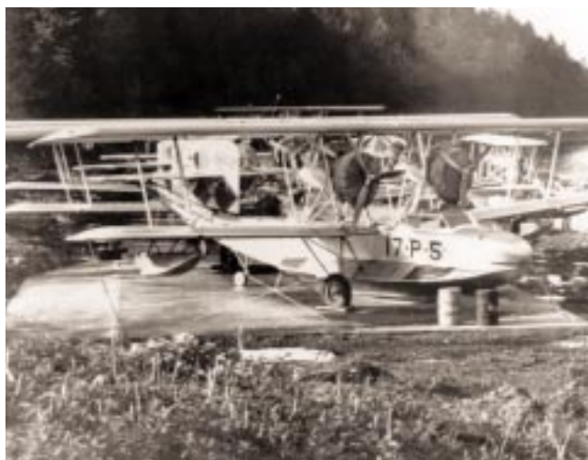
A squadron PM-1 at Sitka, Alaska.