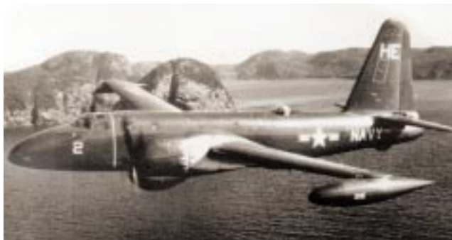
A squadron P2V-4 on patrol in 1952.

14 Apr 1950: The first of the new P2V-4 aircraft arrived and familiarization training was begun. Problems with the engines prevented the squadron from meeting its operational obligations for several months. The difficulties were not fully corrected until late 1951.