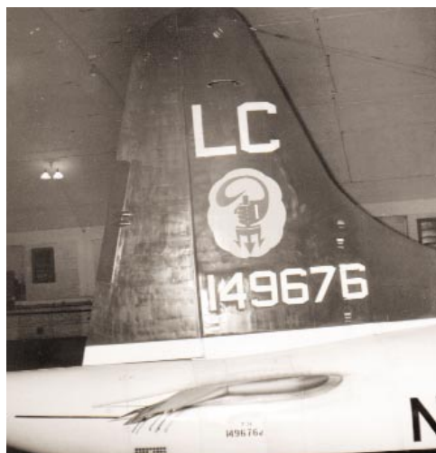
A close up of a squadron P2V tail showing the squadron's fourth insignia and its tail code LC.