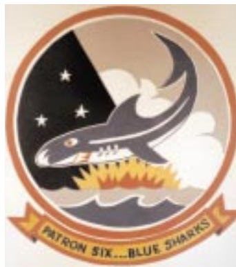
This is the squadron's modified shark insignia approved by CNO in 1962.

The squadron's second insignia was derived from the name "Blue Sharks" based on a 1950 Colliers magazine article titled "Blue Sharks Off the Red Coastline." The article described the squadron's operations off the enemy coast during the Korean War. The shark, "Mano" in Hawaiian, is regarded as a fierce warrior and hunter. It patrols the ocean, searching for prey and protecting its territory. The insignia portrayed a blue shark, arching over a splash in the sea where ordnance had obviously just been dropped. The squadron designation was inside scrollwork at the bottom of the circular patch. Colors: shark, blue with white highlighting; background, white; left quadrant of patch blue with white stars; water blue, with white splash from dropped depth charge; scroll at bottom,