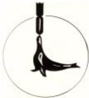
The squadron's first insignia used a seal, indicative of its operations in Alaskan waters.

Patrol Squadron 17F was established at FAB Seattle, Wash., in 1937. The insignia submitted by VP-17 to the Bureau of Aeronautics was approved on 16 November 1938. Since most of the squadron's activities took place in Alaskan waters, a lion seal was chosen as the central figure. The outline of the insignia was circular, with the seal in the center balancing a bomb on it nose. Colors: outline of insignia, black; background, white; seal, black; and bomb, black. There were no letters or numbers on the insignia designating the squadron.