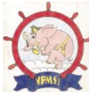
A cartoon design pink elephant was approved for the squadron's second insignia.

Colors of the design were as follows: body of whale, light blue; wings, medium blue; submarine, black; markings on submarine, white; teeth, white; background of eye, white with black pupil; whale outline, black. The squadron's second was approved by CNO on 28 March 1947. This colorful cartoon design had a red ship's wheel as the border and the inside background was light blue with white clouds outlined in black. A pink elephant was walking on the clouds dressed in the motif of an inspector searching for the illusive submarine. The elephant had a magnifying glass in its trunk and a pipe in his mouth. He was wearing a small hat and had a waist band with a gun holster. The pipe, magnifying glass, belt and holster were yellow with black markings. His hat was yellow and green with black markings. The elephant's feet were orange and his eye was black, blue and white. The banner was blue with black markings and the lettering was yellow with black markings.