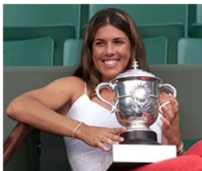
Jennifer Capriati (USA)