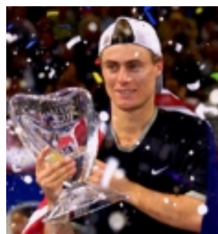
Lleyton Hewitt (AUS)