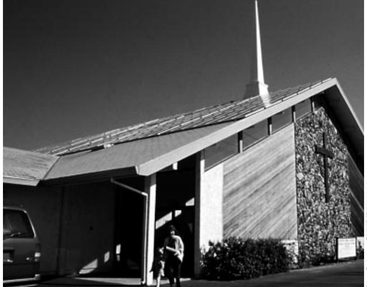
A shift from utility central generation to residential and commercial rooftop PV applications is evident in a Sacramento Municipal Utility District project that resulted in PV panels on this California church.

This typical growth profile of a technological enterprise such as PV highlights two points: (1) Positive annual cashflow does not ensure business success; 70% of businesses still fail at this point. (2) Net cashflow is still negative when sales begin; sales does not mean that outside financing is no longer necessary.