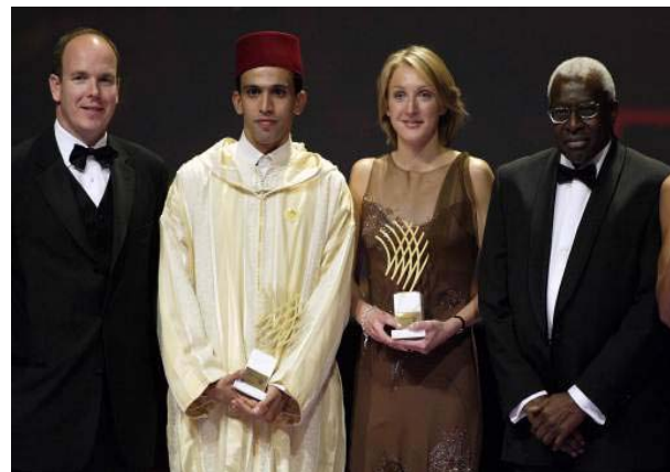
HSH Prince Albert of Monaco, Athletes of the Year Hicham El Guerrouj & Paula Radcliffe and IAAF President Lamine Diack

and out-of-competition. In 2002, the IAAF became the first sports federation to test for EPO out-of-competition, without warning.