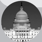
No Child Left Behind Act of 2001, Conference Report

"Where topics are taught that may generate controversy (such as biological evolution), the curriculum should help students to understand the full range of scientific views that exist, why such topics may generate controversy, and how scientific discoveries can profoundly affect society."