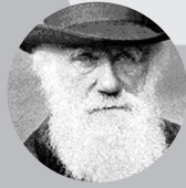
Charles Darwin, The Origin of Species

"A fair result can be obtained only by fully stating and balancing the facts and arguments on both sides of each question."