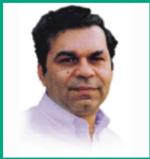
Dr Eliyahu M Goldratt

author of 'The Goal' and Critical Chain'