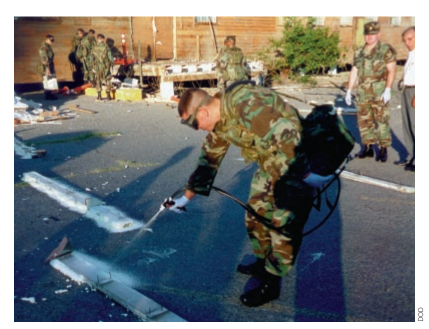
Using sticky foam to create a road obstacle.