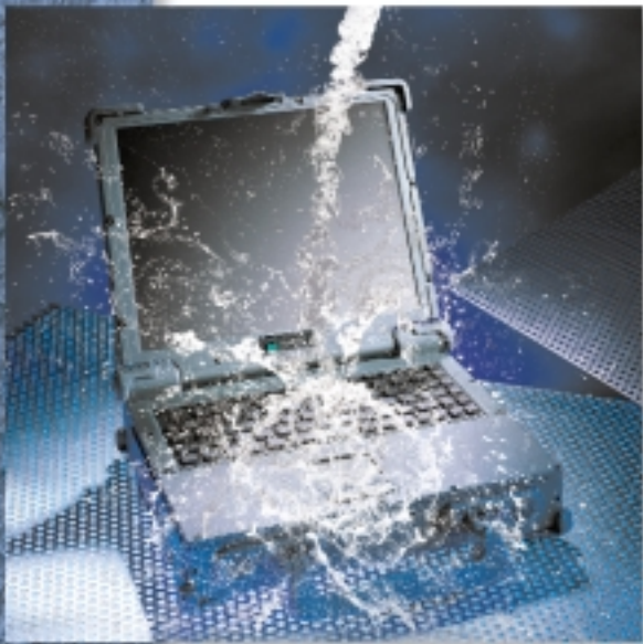
All-Metal Weatherproof Notebook