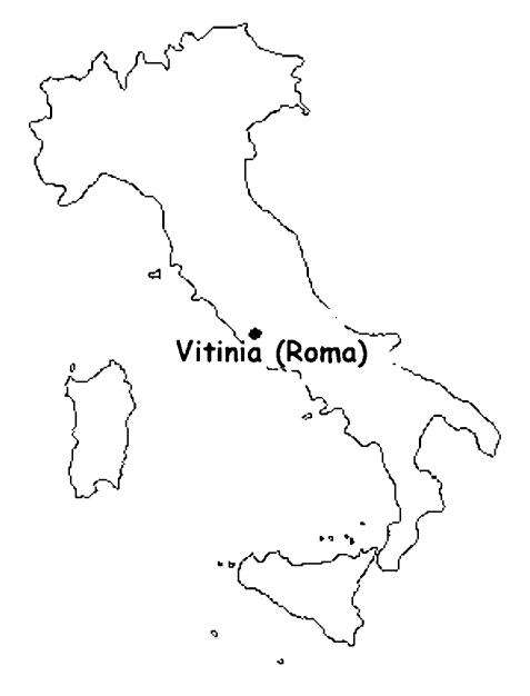
Fig.1 - Location of Quartaccio quarry (Vitinia, Roma).

quarry can be divided into 4 Formations: Ponte Galeria Fm., San Cosimato Fm., Aurelia Fm. and Vitinia Fm. The Pleistocene deposits and the vertebrate remains coming from the Vitinia Formation have been studied by several authors (Conato et al. 1980, Caloi et al. 1983, 1998). In particular, the vertebrate fauna, including the