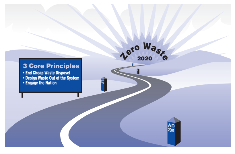
THE ROAD TO ZERO WASTE

Rapid and accurate monitoring systems will be required to assess what waste is being produced, its composition and its source. This information needs to be fed back to the waste producer and to the community at large in a feedback loop. Feedback on the achievement of intermediate targets also needs to be made highly visible - at both local and national level.