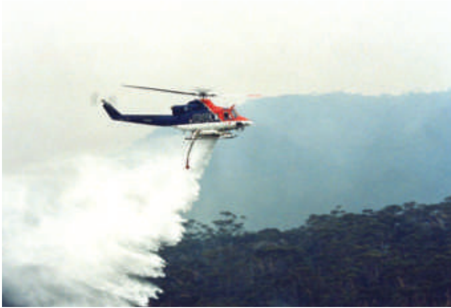
Smother: A Bell 212, one of the firefighting “workhorses” releases a load.