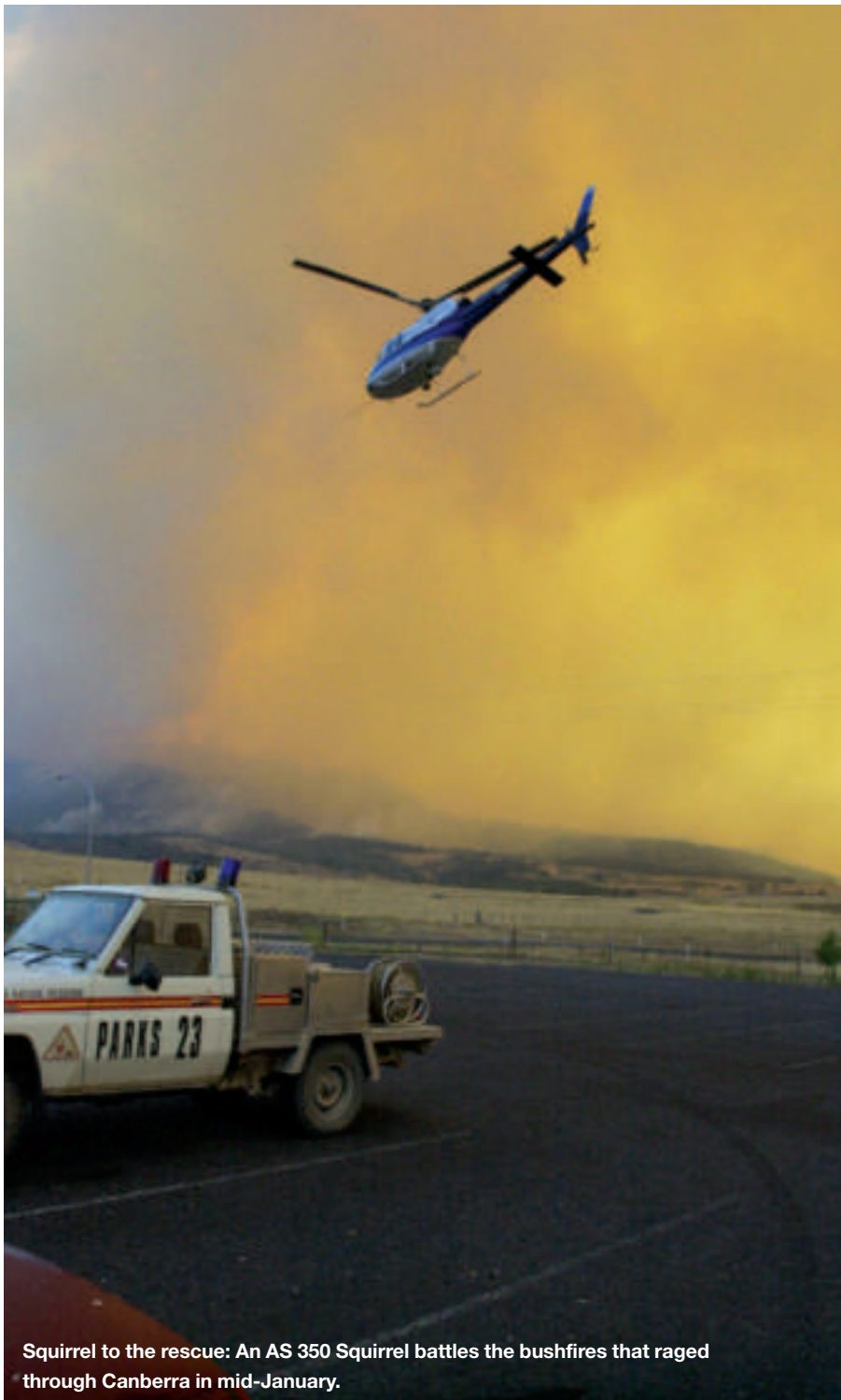
Squirrel to the rescue: An AS 350 Squirrel battles the bushfires that raged through Canberra in mid-January.

With their ability to fly and land in confined clearings, helicopters are also used to drop firefighters off in pre-agreed locations, and to tackle fires in mountainous terrain where it is too risky to operate larger aircraft.