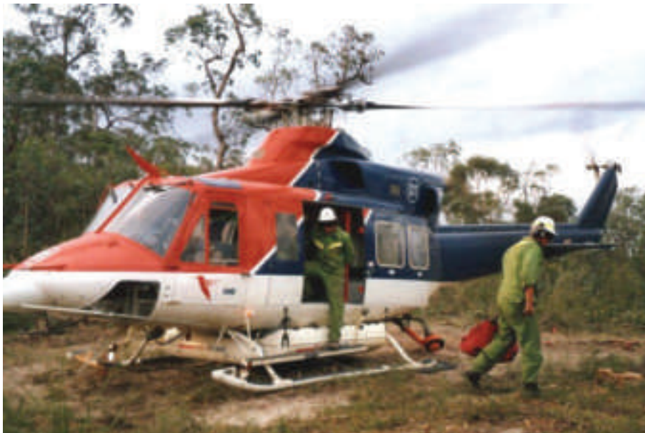
Ground attack: Fire crew unload their Bell 212.

Fatigue: CHC Helicopter Australia, which has a major firefighting contract with Victoria, has a fleet of up to four aircraft available for duty seven days a week during daylight hours for the duration of the fire season.