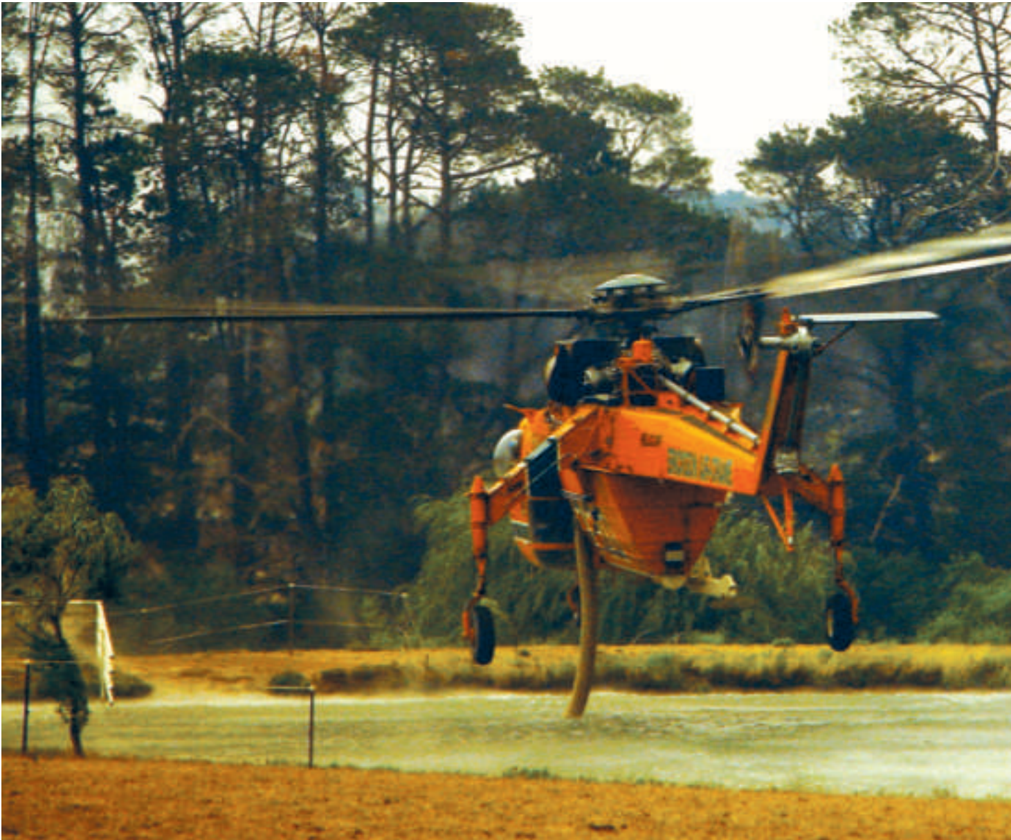
Water power: The Erickson Aircrane refills during firebombing operations. Its engines generate 9,600 horsepower, enabling it to lift up to 10,000 litres of water.

Staying in touch: Aerial firefighters need to keep in touch with each other and ground personnel in difficult conditions and, often, on multiple frequencies.