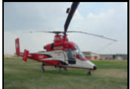
Helicopters used to fight the January fires in NSW and ACT (from top) a Bell 204; a Bell UH-1; an Aerospatiale Gazelle; and a Kaman K-Max.

and food and amenities for personnel. The manager enlists aircraft handlers, refuellers, air attack controllers, retardant specialists and air base fire protection crews, and gets water tankers onto site.