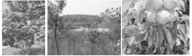
Northern Catalpa; #1 on the Map, Classic Chalco scene & Ohio Buckeye with poisonous fruit

The Chalco Hills Arboretum has taken years of planning, planting and cultivation. It features thousands of trees and shrubs that are great examples of what grows well in Nebraska, as well as some unusual trees that are just now being discovered as compatible to the climate here. It is designed to enhance the outdoor experience for park visitors as well as to help educate them about trees. Take a look around; if you want more information on a