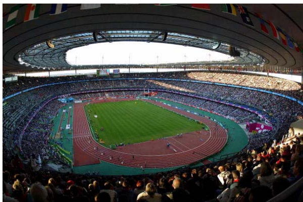
Stade de France - filled to capacity

The IAAF has been encouraged by some of the early TV broadcast data for 2003 World Championships in Athletics supplied to them by Sponsorship Intelligence, a specialist research company.