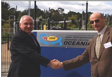
Over 100 guests attended the Official Opening ceremony of the HPTC-Oceania on 3 December 2003.