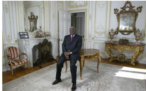
Photo - President Lamine Diack in the IAAF HQ, Monte-Carlo

individual Event and Overall IAAF World Rankings have enhanced the profile of each athlete and the sport as a whole.