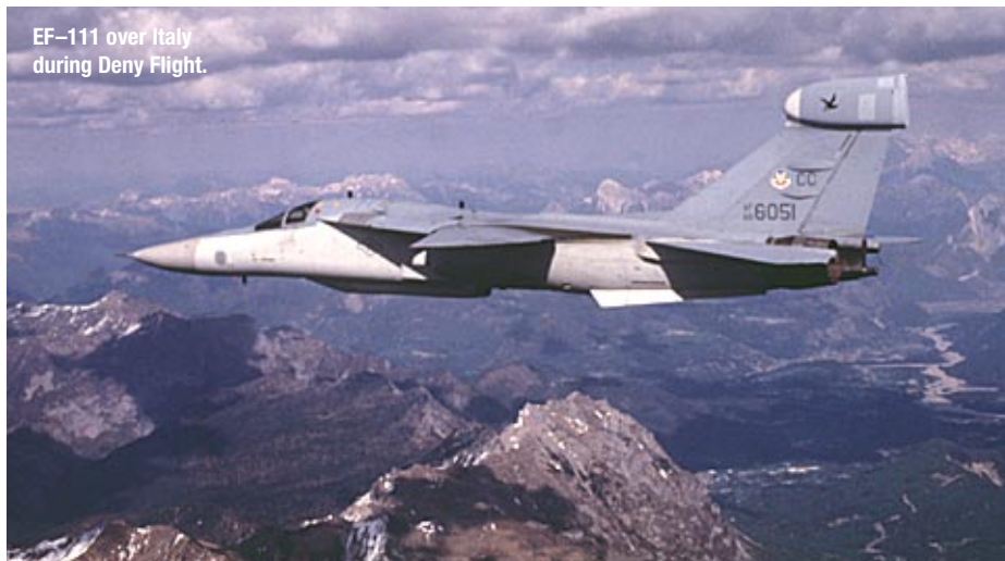
EF-111 over Italy during Deny Flight.