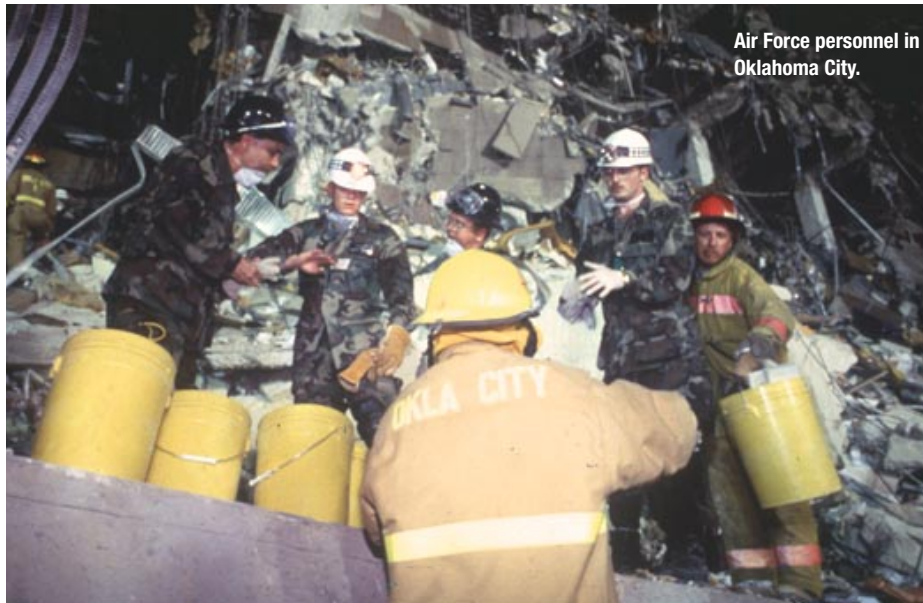
Air Force personnel in Oklahoma City.