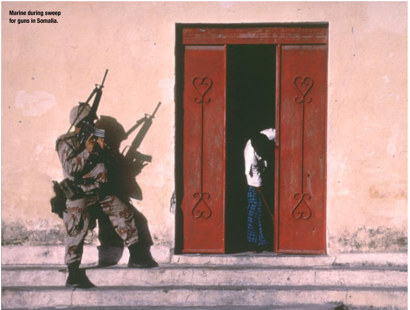
Marine during sweep for guns in Somalia.