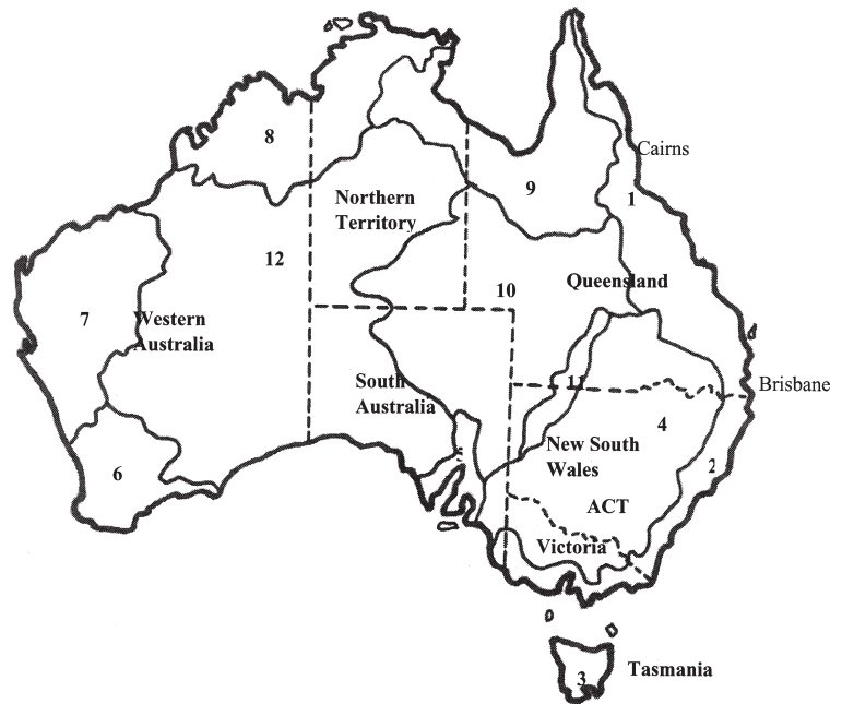
Fig. 2 Map of Australian drainage division boundaries (dotted lines) and State borders (solid lines, bold text).

NSW (NSW Fisheries 2002; Table 1) and concern has been expressed at the potential introduction of Murray cod ( Maccullochella peelii peelii Mitchell) and golden perch ( Macquaria ambigua Richardson) into Western Australia for aquaculture and recreational fishing (Morgan et al. 2002). Murray cod have illegally been translocated into waterholes in the south of the Northern Territory, raising concerns that they may find their way onto the Finke River system, a system naturally devoid of a large piscivorous fish (H. Larsen pers. comm.). Native and exotic species may also escape from aquaculture facilities with examples including brown and rainbow trout, the native Australian bass ( Macquaria novemaculeata Steindachner), trout cod ( Maccullochella macquariensis Cuvier), and short-finned eels ( Anguilla australis Richardson). The recent arrival into Victoria of the Barcoo grunter ( Scortum barcoo McCulloch & Waite), native to Lake Eyre and catchments in Queensland and the Northern Territory, gives cause for concern (Koehn 2002). Records of translocations are erratic, need to be formalised, and should be included as a component of alien species management plans.