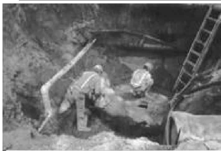
This is the kind of construction going on all day around the neighborhood between 7 a.m. and 4 p.m. . By evening, holes are covered by steel plates.