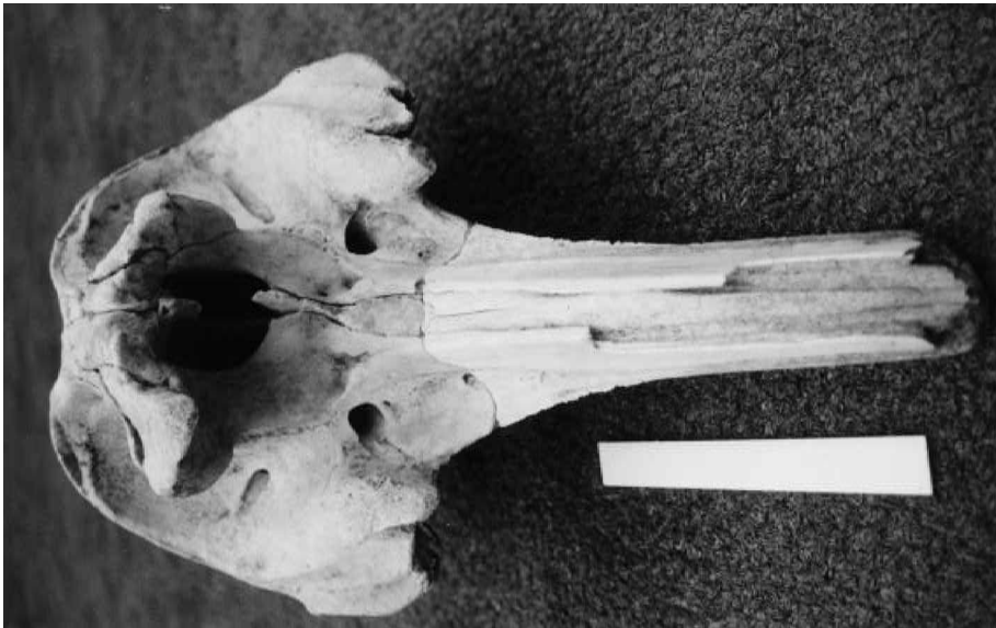
Figure 2. Skull frontal view of the Mesoplodon europaeus (CEEMAM # 127) specimen, showing the extreme development of the vertex. (Scale=15 cm).

The animal was identified as a Mesoplodon specimen based on the extreme development of the vertex (Fig. 2), which involves the postero-dorsal extensions of the maxillary, premaxillary, frontal, supra-occipital, and nasal bones (True, 1910). The