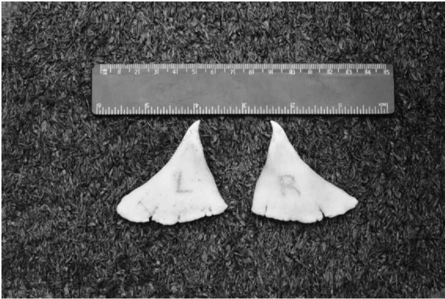
Figure 4. Shape of both collected teeth of the Mesoplodon europaeus (CEEMAM # 127). Pulp cavities were fully ossified (scale=15 cm).

least distance between the premaxillary foramina (33.0 mm). This index was less than 2.0 in all Mesoplodon species, except for M. traversii (Reyes et al. , 1995; van Helden et al. , 2002).