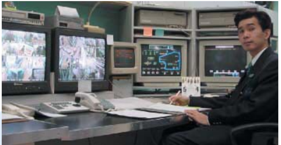
The Monorail central control tower located in Pymont.

At the central control room two main computers are linked in a master/standby relationship. Either machine may be started as master and while operating, the standby stays in a back-up mode, its data base being regularly replenished by the master to ensure that it remains conversant with system conditions and is able to assume full command within seconds, should any failure occur in the master computer.