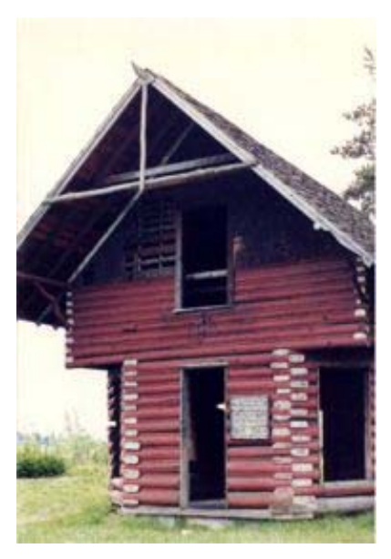
Figure 3 - Denny Cabin today<sup>57</sup>

The Historical Society of Federal Way intends to restore the cabin to its 1889 condition. It will be used as an interpretive center in the Historic Cabin Park. Plans for this park are being developed as a cooperative effort with the city of Federal Way, the state of Washington, the Friends of the West Hylebos Wetlands, and the Historical Society.