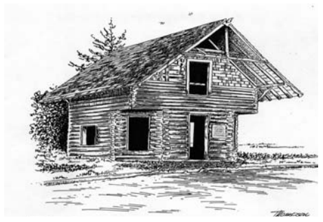
Figure 2 – Sketch of the Denny Cabin at Federal Shopping Way.

In 1989, proposed construction of a road where the cabin stood forced some sort of action to be taken to save the Denny cabin standing in the south end of the Federal Way Shopping Center. Two other cabins left In the files of the HSFW.