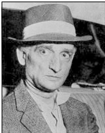
Rudolph Ivanovich Abel

There are actually several biographies of Fisher. There is the true one that is based on available information