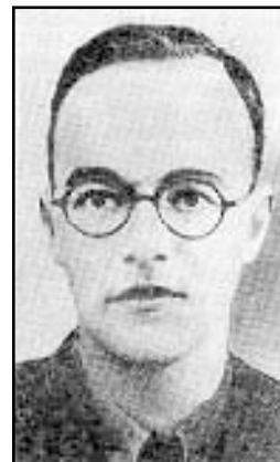
Klaus Fuchs, a German-born nuclear physicist.

According to Klaus Fuchs' own statement, when he was first brought into the British program during the early 1940s and learned the purpose of the work, he decided to inform the USSR. He contacted the office of the Soviet Military Attaché in London and embarked upon his career of professional espionage agent for the Soviet Union. With all the classic trappings of clandestine activity, Fuchs collected the information at his disposal, passed it on to secret couriers, and met his Soviet principals in Britain and in various parts of the United States. He gave the Soviet Union extensive data