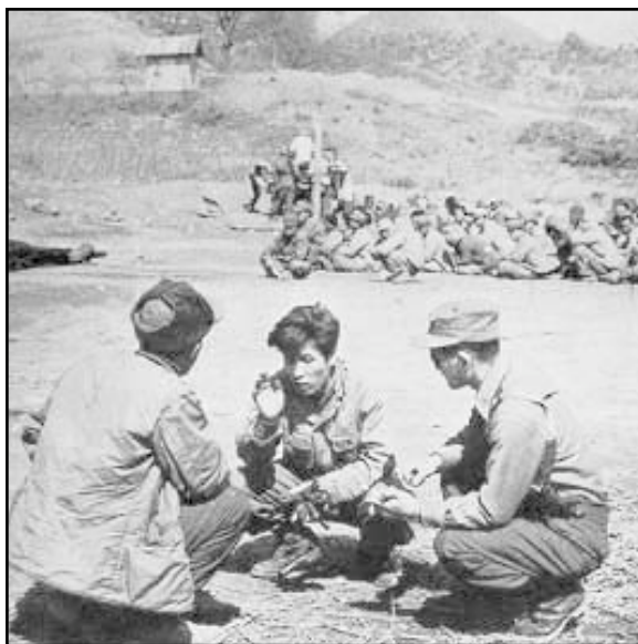
Interrogating a North Korean.

Upon completion, this study reached the rather indefinite conclusion that only total national censorship embracing the armed forces, mail, and public information media could possibly hope to solve the