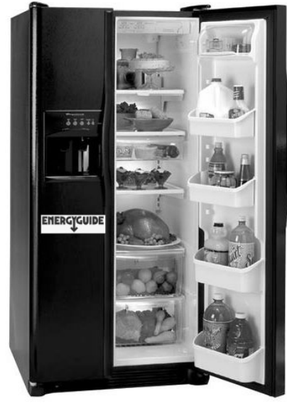
Consumers are looking for energy efficiency labels when purchasing new home appliances.

A recent survey by Primen, an energy market-intelligence company based in Madison, Wisconsin, concludes that U.S. consumers now rate energy efficiency as the most important factor when purchasing new home appliances. This represents a significant departure from previous findings where price was always the main concern, and energy efficiency was of only moderate importance.