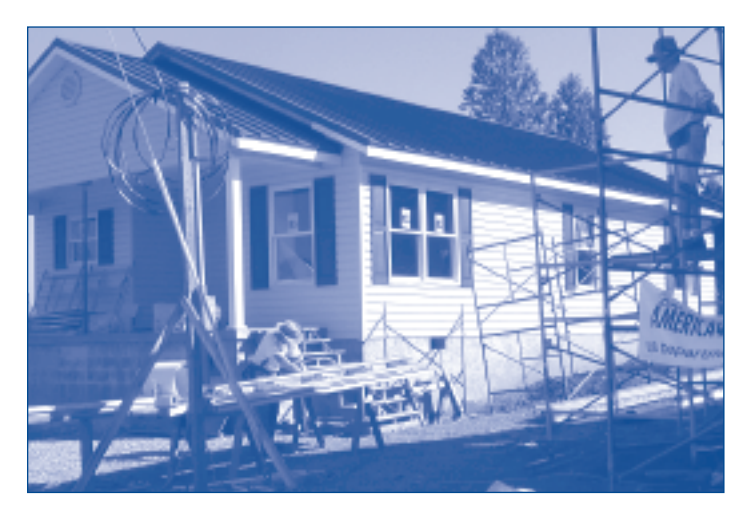
The second house being built in the research series, as it looked Sept. 24.

The Tennessee Valley Authority pays the homeowner for the house's rooftop photovoltaic output. TVA pays 15 cents