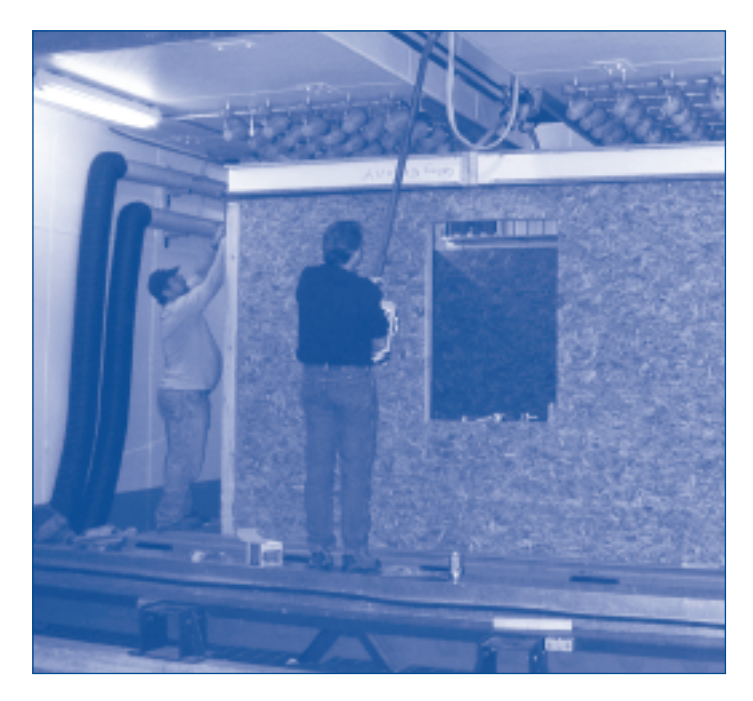
A 12-foot by 12-foot, 8-foot-high test room under study in the ORNL Large Scale Climate Simulator.

Oak Ridge National Laboratory (ORNL) and two Building America project teams are monitoring a house they built that is stuffed to the rooftop with energy-saving technologies. It is the first in a planned series of six test houses with the goal of eventually building a structure that has zero net energy consumption.