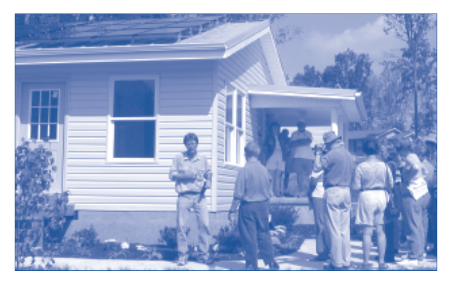
The first in a series of test houses draws an audience in Lenoir City, TN.

per kilowatt hour (kWh) for that power, in an area where the retail rate for electricity is 6.3 cents per kWh.