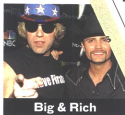
Big & Rich