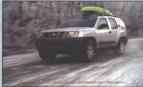
Professional driver. Closed courier. Allmarkel snow tires shown.

For this campaign, Nissan North America worked directly with ad agency TBWA\Chiat\Day West, which in turn worked with music design company DeepMix and Universal Music