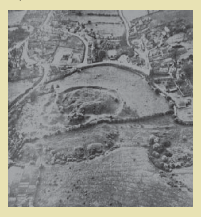
South Kesteven Community Archaeology Walks