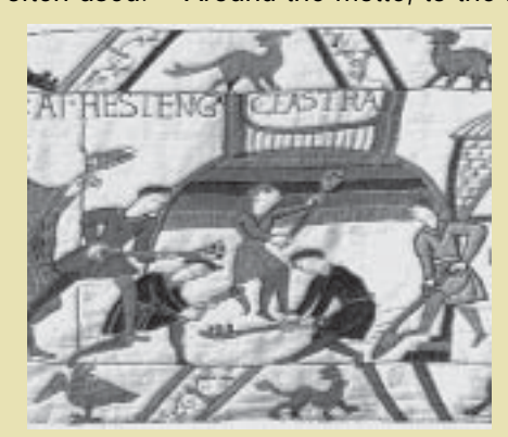
Norman Conquerors build a Motte at Hastings

There is a small footbridge leading into the land around the base of the Castle (the fortifications themselves are on private land). There are about 600 Motte and Bailey castles like this one in the country; most were built with great speed soon after the Norman Conquest. The Bayeux Tapestry illustrates one being thrown up at Hastings immediately after the battle. The motte or mound is the most conspicuous feature here and is built on the tip of a natural spur. Despite the huge quantity of earth moving necessary, historical records show that these castles were often constructed in a week or less. It is known that forced labour was often used. Around the motte, to the rear of what we can see