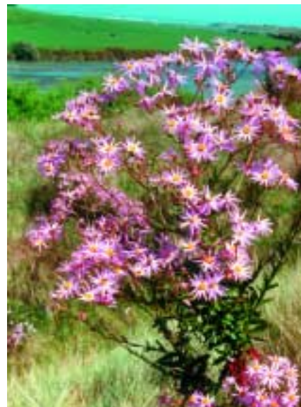
Holly leaved senecio grows frequently near waterways and on hillsides, coastal dunes and disturbed areas.

Holly leaved senecio may potentially be eradicated before it becomes a problem in other locations in Western Australia. Any new outbreaks should be reported immediately to your state or territory weed management agency or local council. Do not try to control holly leaved senecio without their expert assistance. Control effort that is poorly performed or not followed up can actually help spread the weed and worsen the problem.