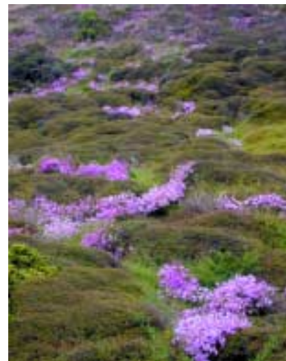
Holly leaved senecio is particularly invasive in open damp areas, and has the ability to dominate understorey vegetation in these conditions.

Holly leaved senecio can be confused with wild cineraria ( Senecio elegans ) at a distance, but up close the two plants are quite different. Wild cineraria is a much softer looking plant, with more succulent and hairy leaves and stems than holly leaved senecio. Wild cineraria is also an annual plant.