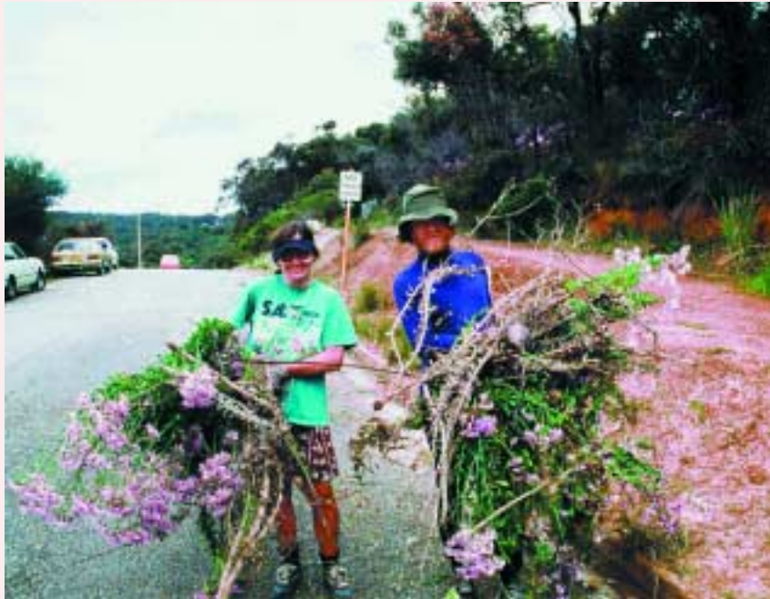
After hand-pulling, holly leaved senecio must be removed from the site, to avoid a recurrence of the infestation in the following year.