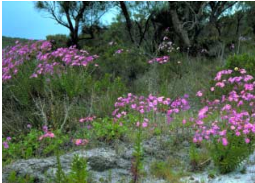
Holly leaved senecio invading Allocasuarina open woodland in Western Australia.