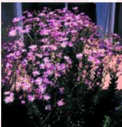
Holly leaved senecio is a short-lived perennial bush.