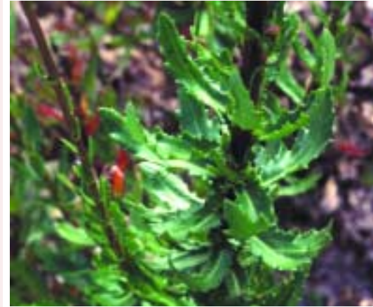
The leaves of holly leaved senecio are highly serrated and can be prickly to touch. They are different to other senecio species.

Holly leaved senecio flowers in late spring. After the flower matures it leaves white fluffy balls of seed, which are apparent in summer and early autumn. The plant germinates in wetter conditions from early autumn through winter, and regrowth of existing plants occurs during the same seasons. Holly leaved senecio generally does not experience a period of dormancy, although in drought conditions it may not grow at all over summer.