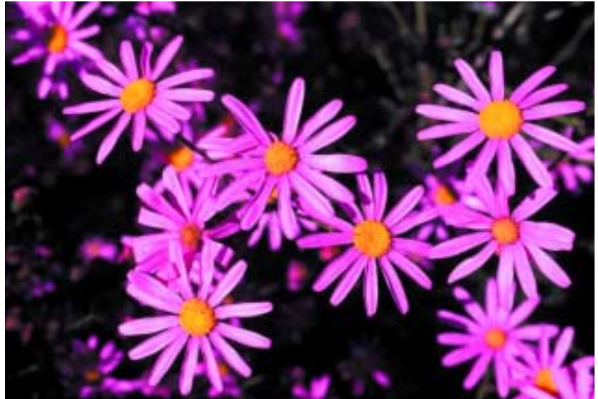
The flowers of holly leaved senecio have yellow centres surrounded by mauve petals.

Being a garden plant, it is quite likely to be available in nurseries, and seeds can be sourced over the internet. With much of southern Australia's climate being similar to that of South Africa, the potential for holly leaved senecio's spread throughout Western Australia, South Australia, Victoria and Tasmania is significant.