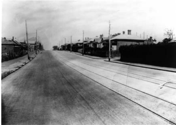
Bulwer Street in the 1920s