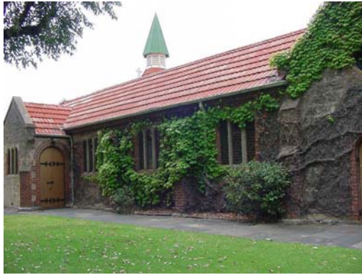
St. Albans Church (Photographed in 2000)