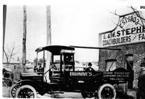
Browns Truck on Oxford Street

The material remnants of our past, from warehouses to parklands and houses to schools, serve as tangible reminders of how life used to be in the Town of Vincent and how life has changed over time. These remnants make the Town unique in Western Australia, and indeed Australia.