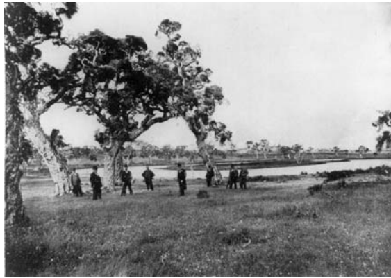
Site of Hyde Park prior to development in 1890

Aboriginals had sighted Europeans along the western coast since the seventeenth century, and perhaps earlier, and there was some contact, not all of it friendly. There are few records of encounters with the indigenous people during the first months of European settlement in the Swan River Colony. This may in part be explained by their migration during the winter season that coincided with the colony's foundation. 7 However, the dual occupation of the Swan River area by these two peoples, which was based on contrasting land value systems, saw the early friendly exchange of surplus fish for bread and flour replaced by conflict, and displacement and institutionalisation of indigenous people. Clashes were inevitable, as the two populations were large-scale users of land. 8 It was not long before the Nyungar community was devoid of its traditional land use along the Swan River.