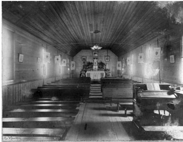
Inside of Sacred Heart Church

Development was rapid in Leederville and North Perth. In May 1895, the section of the Perth Road District covering Leederville and West Leederville was gazetted Leederville Road District. 64 Less than twelve months later, Leederville became a municipality, having sufficient property within its boundaries to provide a minimum of £300 in annual rates at a rating of not more than one shilling to the pound. 65 In April 1897, the population of the Leederville municipality had reached more than one thousand and its municipal area was divided into three wards -