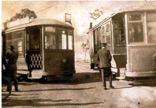
Tram derailment 1925

One of the most significant changes in Perth throughout this period occurred in transport, with motor taxis replacing horses, trams and railways carrying more passengers, and a growing trend towards the use of motorbuses and motorcars. This was creating problems in the major streets, which had not been designed for heavy traffic flows. Loftus Street was widened in 1926, as Charles Street was carrying the majority of