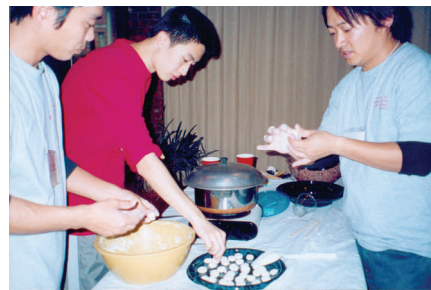
The Japanese teachers prepare for a program with OSU students.