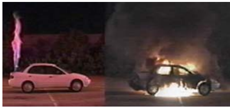
Hydrogen car (l), gasoline car (r). Photo from a video that compares fires from an intentionally ignited hydrogen tank release to a small gasoline fuel line leak. At the time of this photo (60 seconds after ignition), the hydrogen flame has begun to subside, while the gasoline fire is intensifying. After 100 seconds, all of the hydrogen was gone and the car's interior was undamaged. (The maximum temperature inside the back window was only 67°F!) The gasoline car continued to burn for several minutes and was completely destroyed. Photo/Text: Dr. Swain, University of Miami.

be very low. However, at low concentrations (below 10%) the energy required to ignite hydrogen is higher--similar to the energy required to ignite natural gas and gasoline in their respective flammability ranges--making hydrogen realistically more difficult to ignite near the lower flammability limit. On the other hand, if conditions exist where the hydrogen concentration increases toward the stoichiometric (most easily ignited) mixture of 29% hydrogen (in air), the ignition energy drops to about one fifteenth of that required to ignite natural gas (or one tenth for gasoline). See Figure 1 (page 1) for more comparisons.