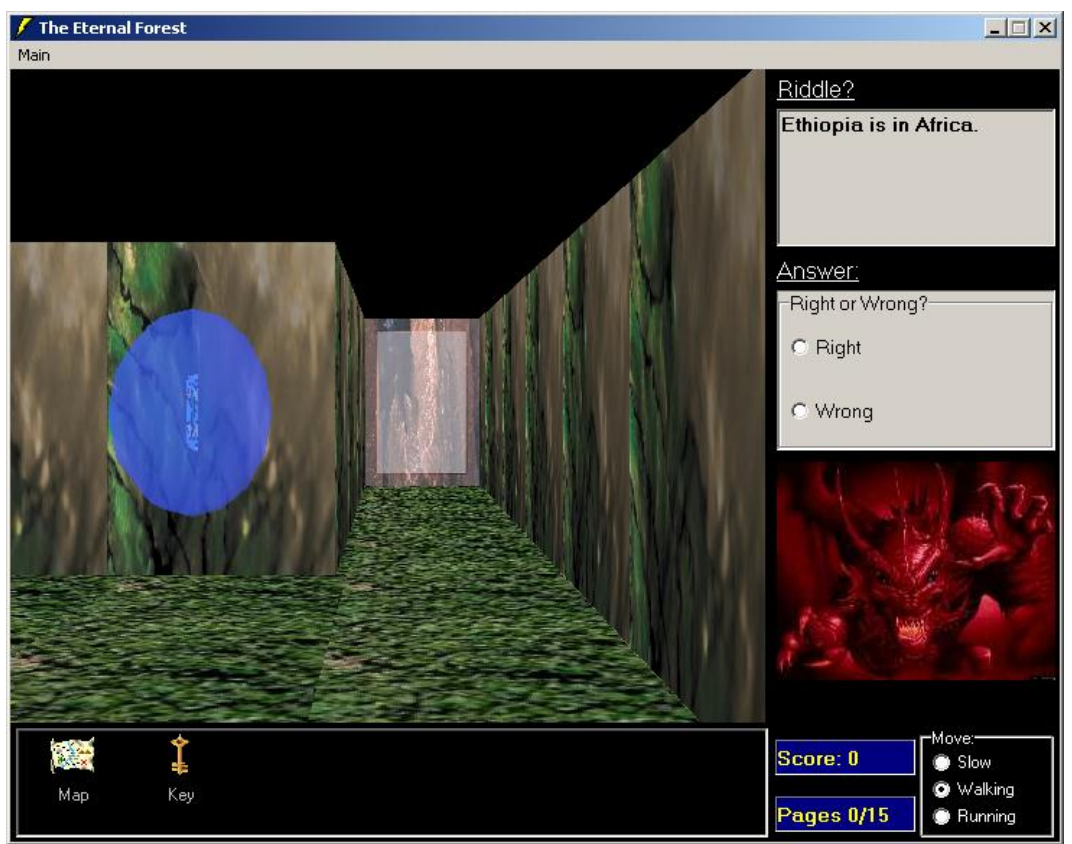
Figure 2. A question posed in the VR-ENGAGE