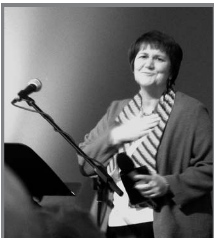
Oliveto: Heart-felt Bible Study