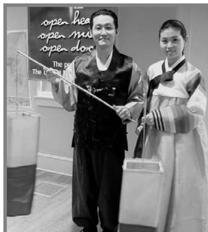
Processing the Light