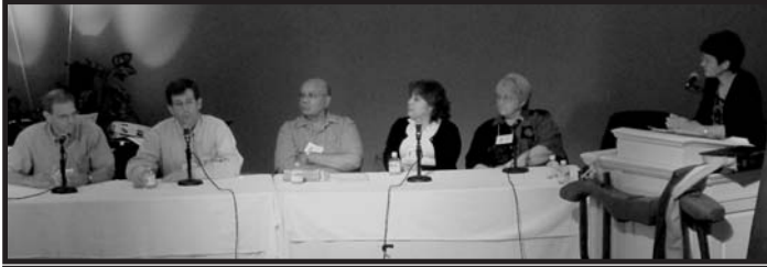
Future With Hope: Panel of Bishops at Lake Junaluska

of door, mind and heart. May God stand by all who gather as well as those who provide hospitality during your days at beautiful Lake