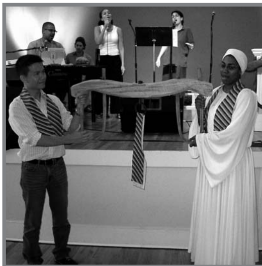
My Yoke Is Easy