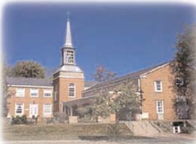
St. Luke's UMC

Greene Community Church, United Methodist, in Greene, RI has been reading the news stories about the actions against GLBT people in various places and churches. This is a small congregation in a rural area that responded with grace and action. While they had been seeing themselves as open to all, they decided it was time to be public in their welcome.