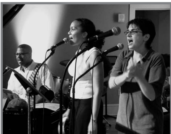
The Band: Spirit Singing

Katalyst Hearts on Fire