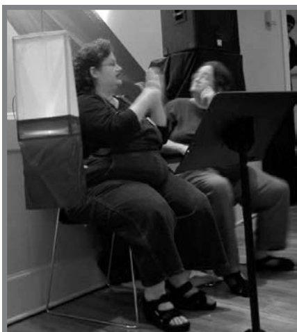
ASL Flying Fingers