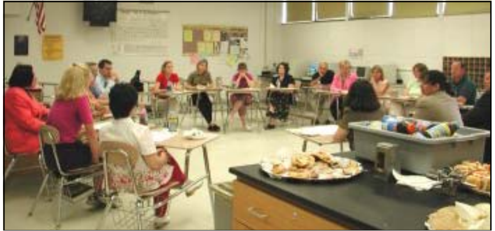
Crisis planning review for the 2001 / 2002 school year.

Prevention involves planning, preparation, data and information collection, training and networking. This year we have addressed "prevention" in the following ways: