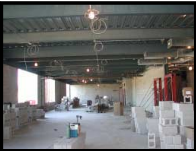
The new classroom space is taking form, partitions will be up soon.

G arnet Valley Elementary School and Garnet Valley Middle School are enjoying a long awaited break from the construction and shifting classroom assignments for now. Plans are in place for future expansion at GVMS when population increases occur.