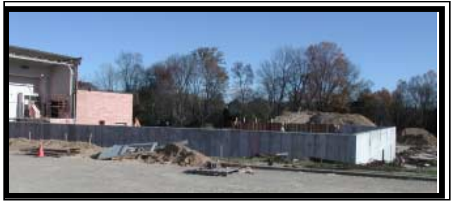
The foundation is in for the gym at the High School

G arnet Valley High School is in the midst of a three year planned renovation that will boost classroom space to house 1,250 students, with core facilities planned to accommodate 1,500-1,700. The most dramatic major changes are apparent on the Smithbridge Road exterior side of the building. This construction adds new classrooms that will accommodate the fine arts and general classrooms. These classrooms should be ready for students during the spring semester.