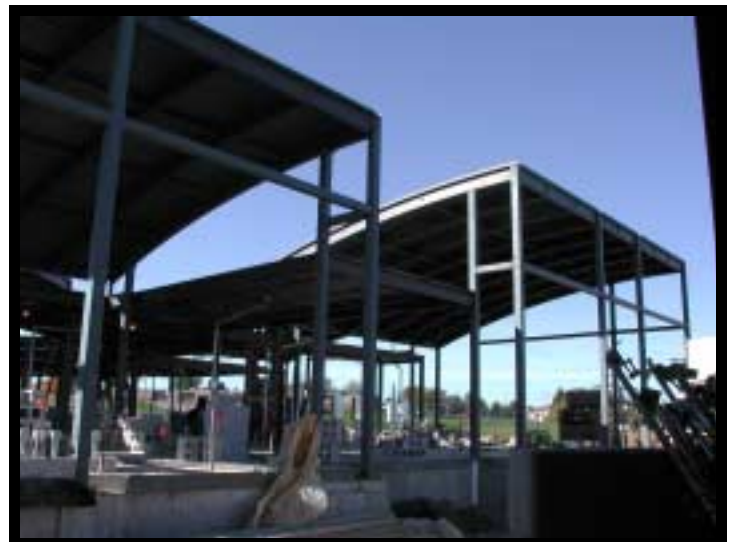
The fine arts classrooms are ready for walls.