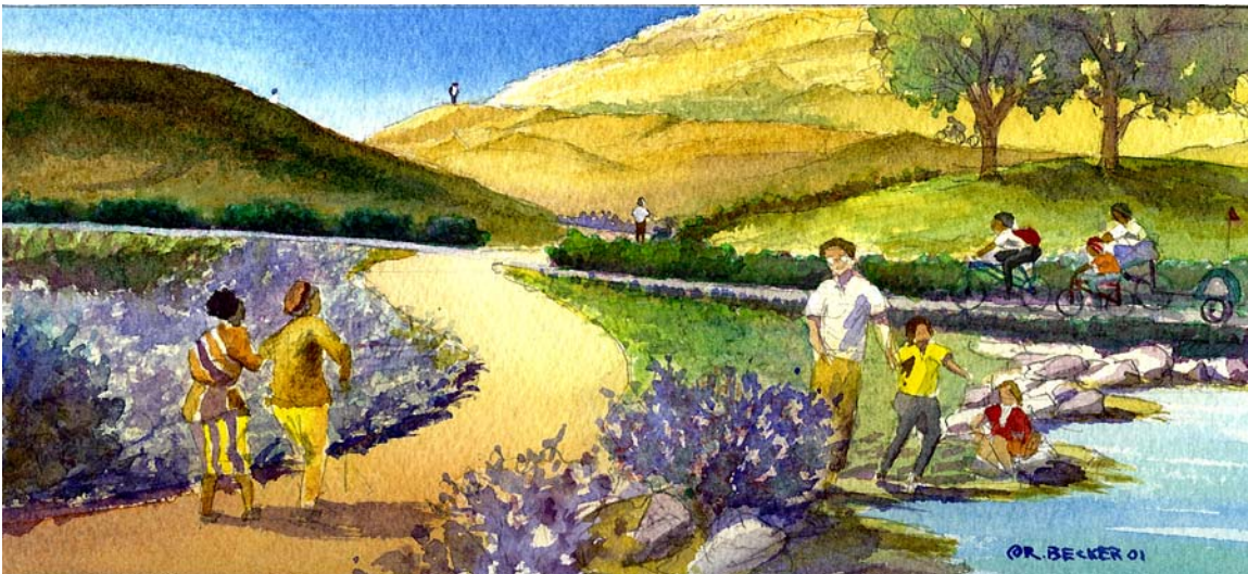
AWARD OF EXCELLENCE, ARCHITECTURE IN PERSPECTIVE 17