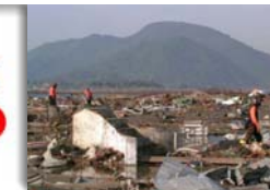
Rover Scouts in Gerakan Pramuka