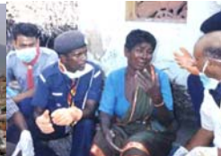
Bharat Scouts and Guides