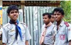
Sri Lankan Scouts at Hospital Ahangama