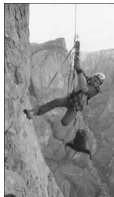
Kurt Albert on La Conjura de los Necios. Stefan Glowacz